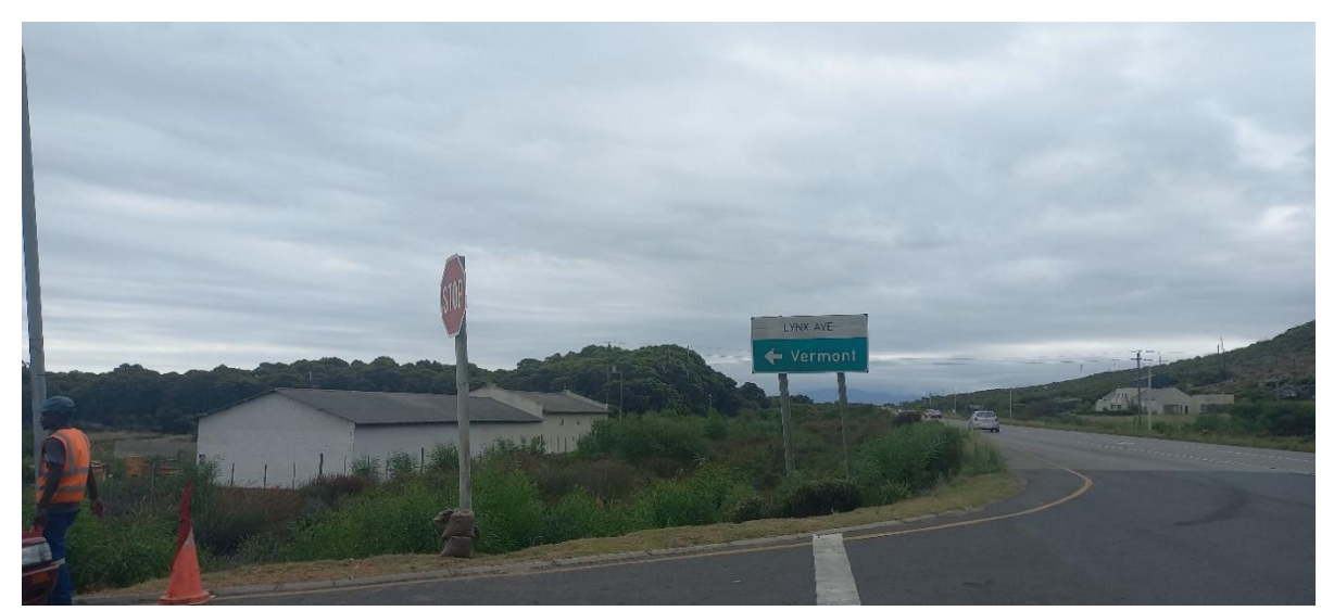
Junction at R43 and Lynx avenue