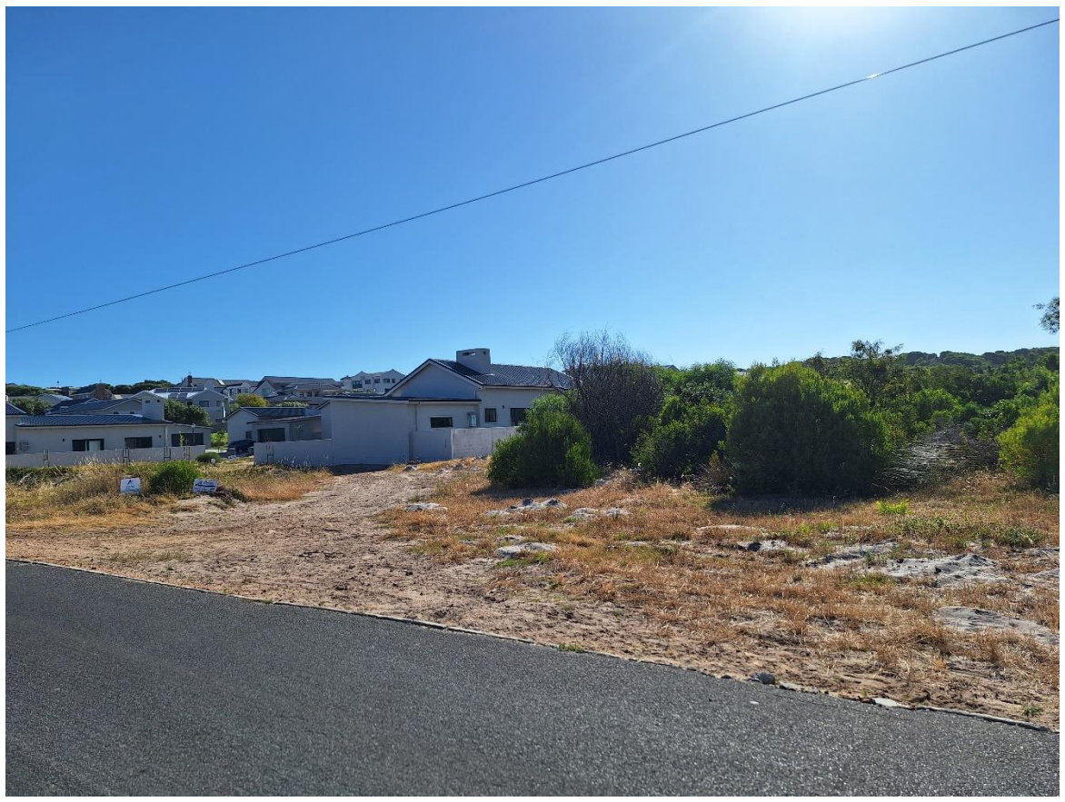
View of the site towards the west. Neighbouring residential development visible in the background