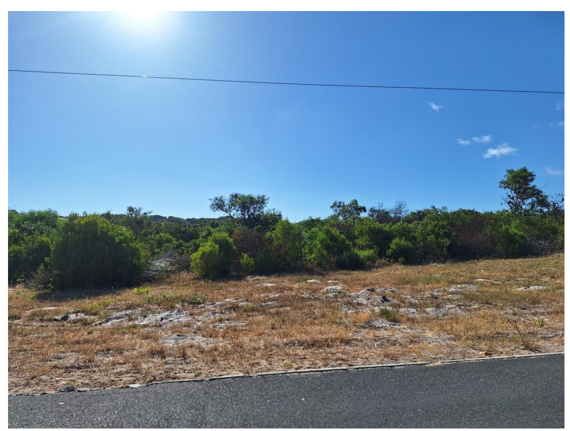
View of the site FROM Lynx towards the east