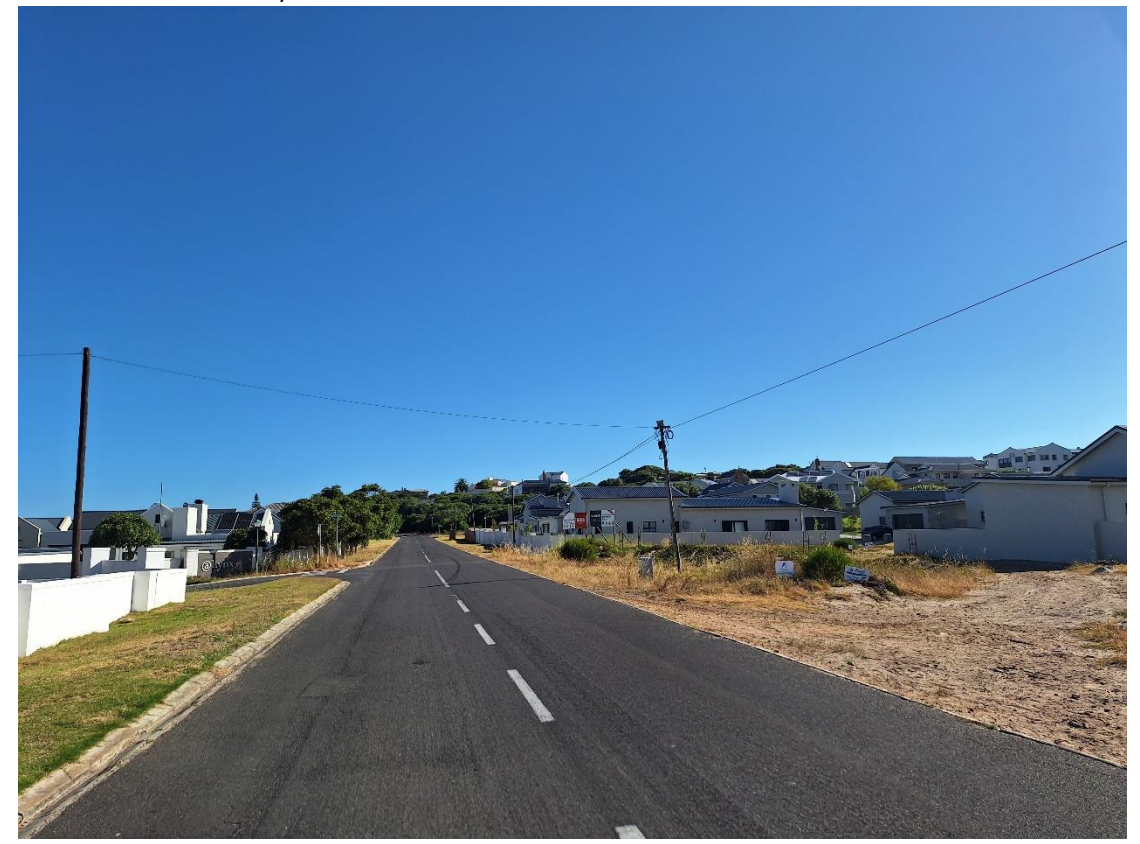
Street view, with proposed development area towards the right, photo looking towards the south