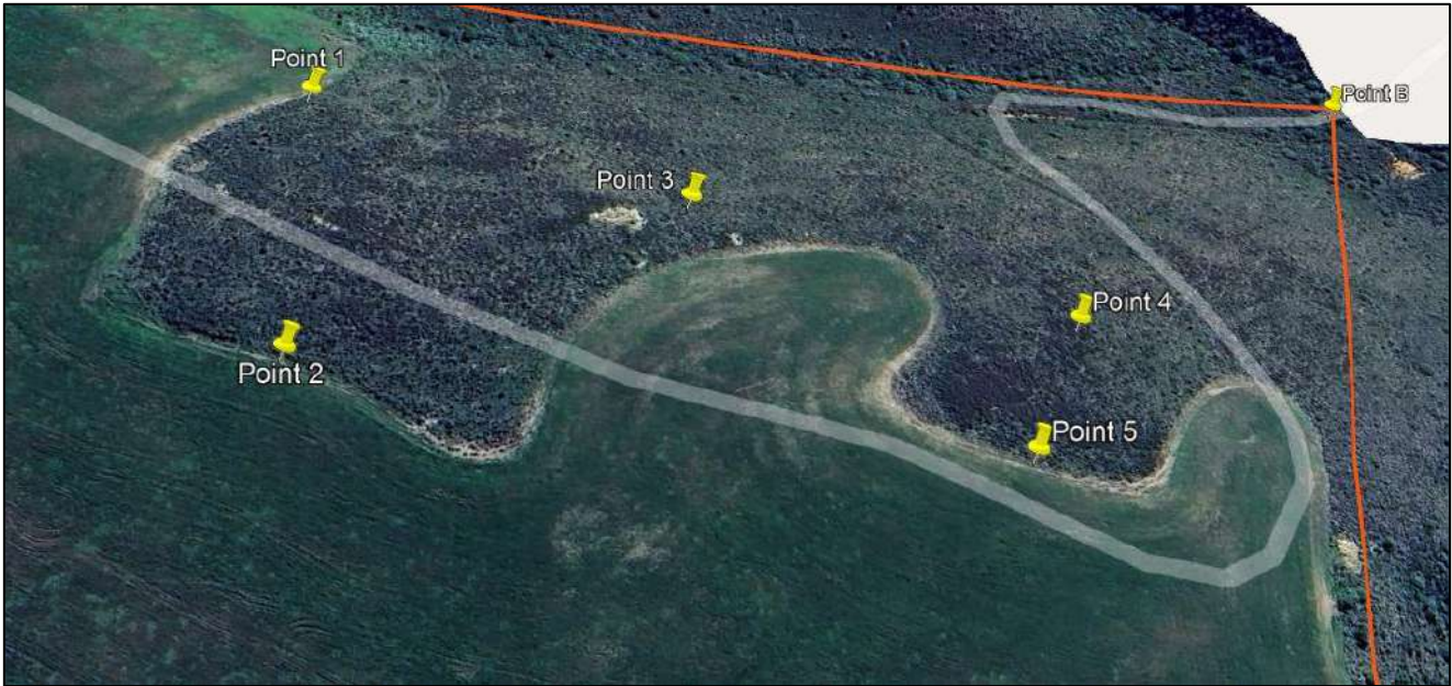
Figure 2: coordinates of the impacted area

The co-ordinates for the site boundary are: