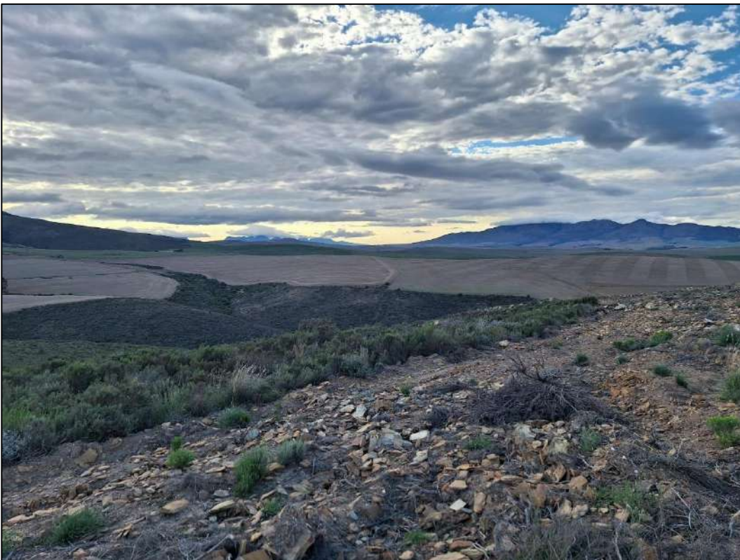
Photo 7. Showing gradual slope of the site, with the cleared area and remaining intact vegetation alongside. The slope steepens in the uncleared areas as ploughing machinery and farming tools cannot access these areas.