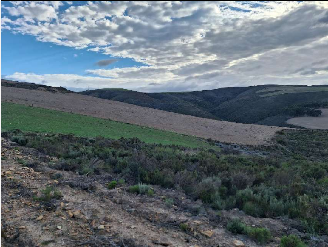
Photo 4. Photo of cleared area alongside remaining intact vegetation.