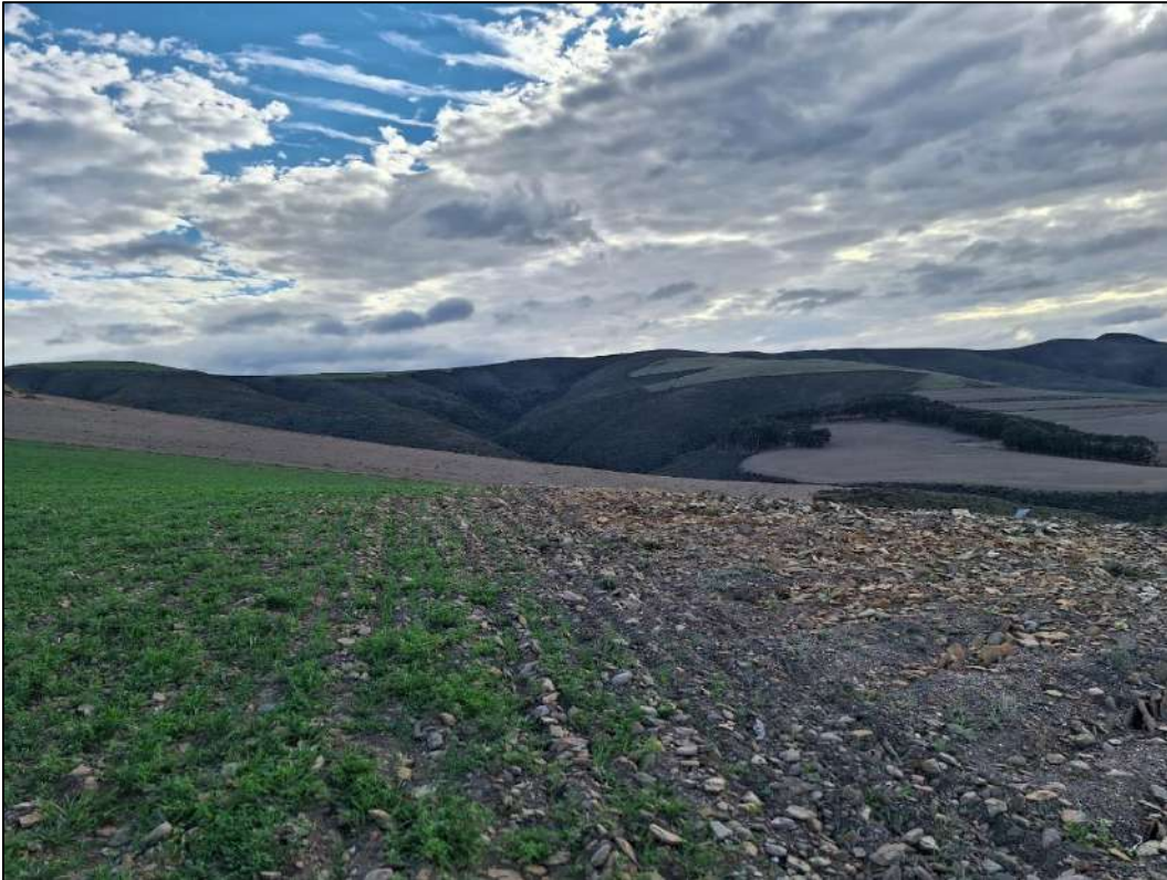
Photo 1: View of the edge between existing farmed area and area cleared

The farmer ploughed and removed vegetation from uneven farming edges alongside existing ploughed and farmed land. The reason for this is to allow for better movement of the large farming machinery required. The subject area, which was impacted, was selected because it is on a gentler slope.