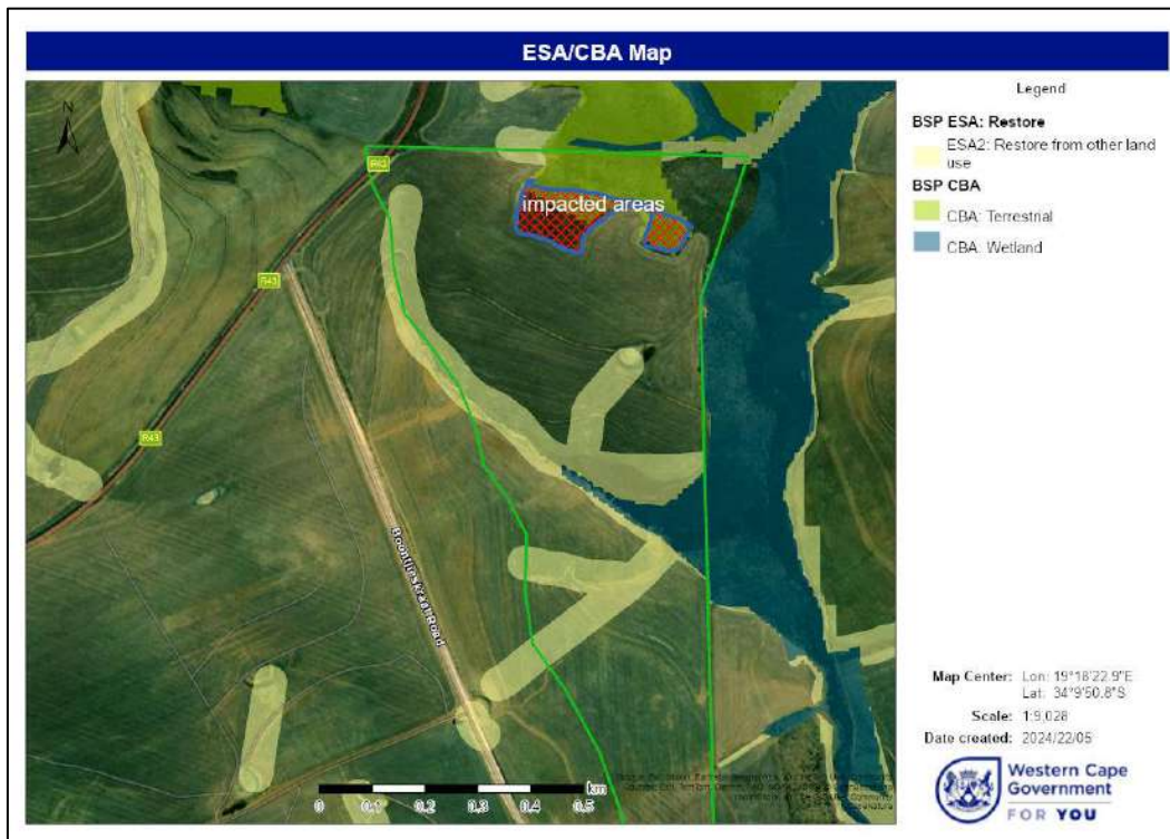
Figure 3. The property as a whole contains CBA1, CBA2, and ESA2 mapped areas. However, the area where the clearance took place only affected the edge of a CBA1 area, as shown on the map above. It is important to note that the areas cleared were located directly alongside actively farmed lands and therefore were already fairly disturbed by the adjacent farming.