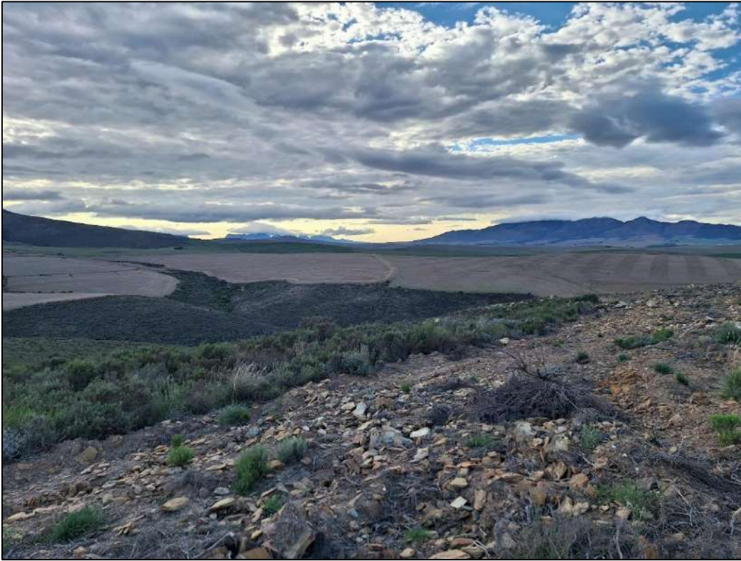
Photo 3. Photo of cleared area alongside remaining intact vegetation.