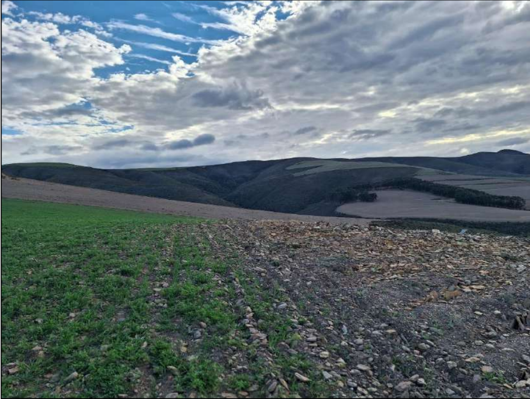
Photo 6. Showing gradual slope of the site