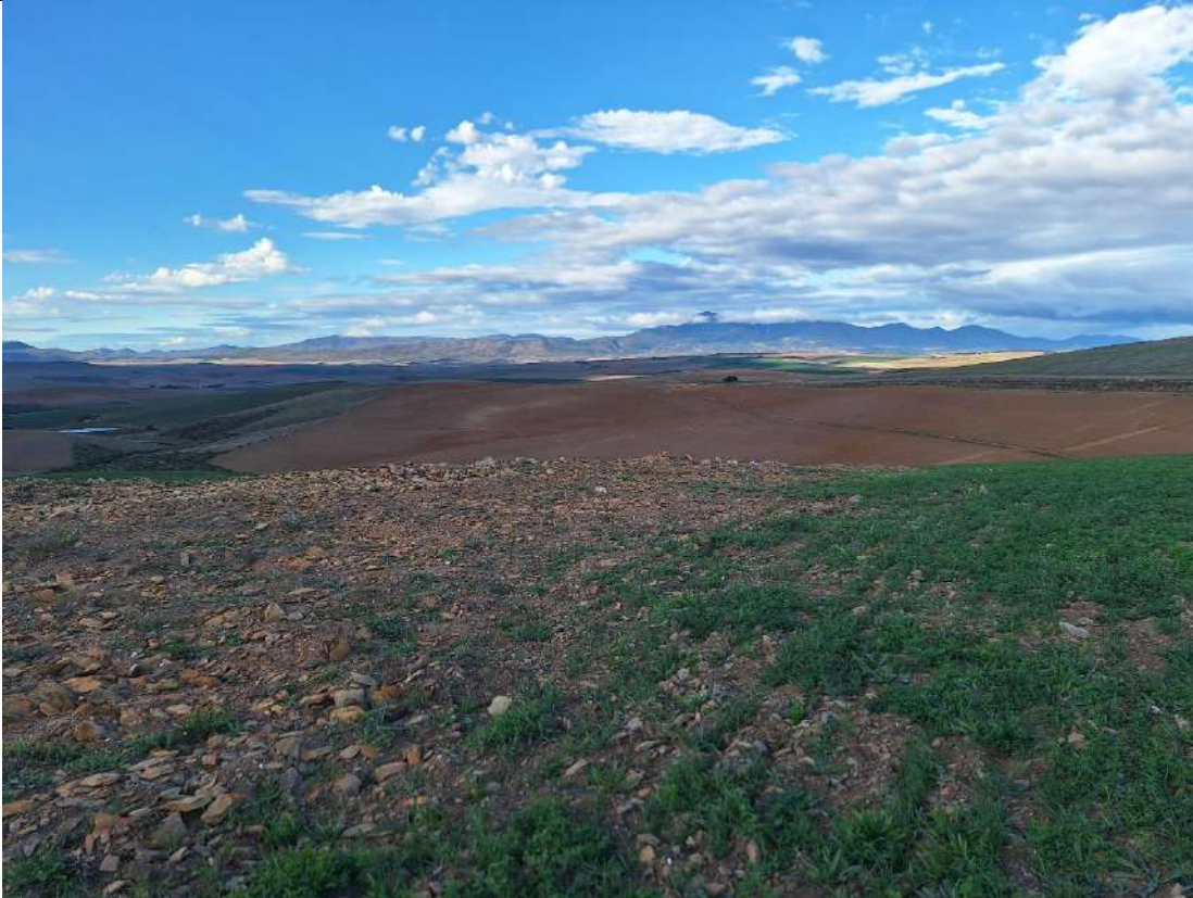
Photo 5. The current state of the site as of May 2024. The clearance of approximately 1.67 hectares of indigenous vegetation within the critically endangered area.