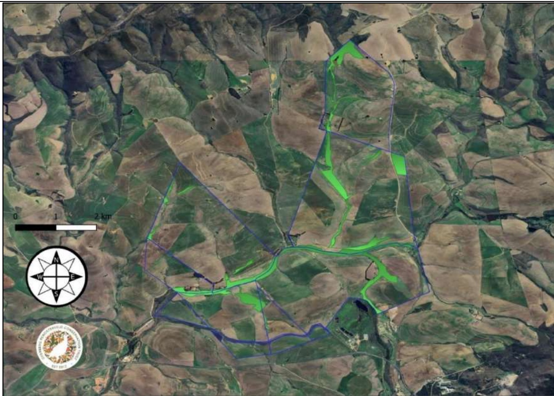
Figure 5. Mapped natural portions for easements.