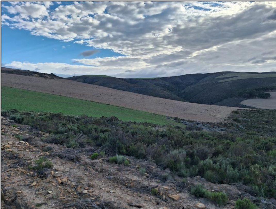
Photo 4. Photo of cleared area alongside remaining intact vegetation (May 2023).