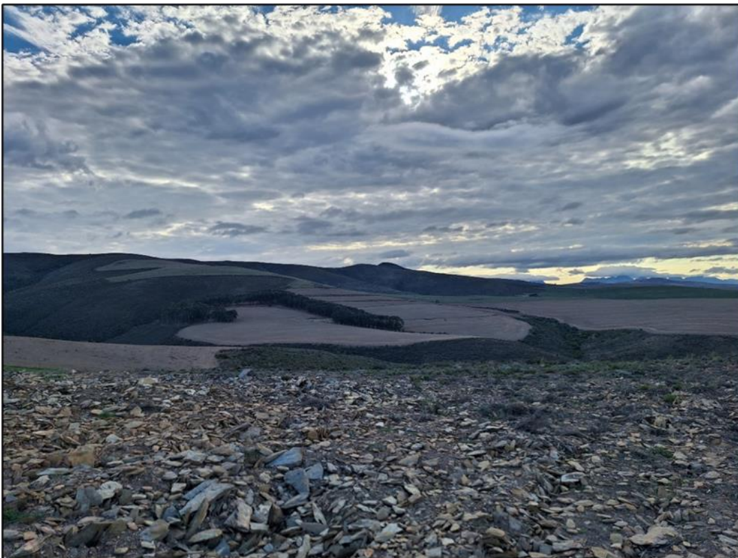
Photo 2. Cleared area on site.