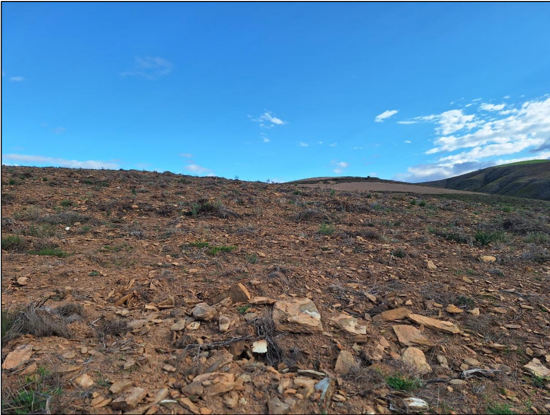
Photo 6. Photo showing roots and remnants of cleared vegetation on the site.