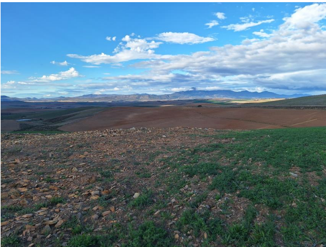
Photo 5. The current state of the site as of May 2024. The clearance of approximately 1.67 hectares of indigenous vegetation within the critically endangered area.