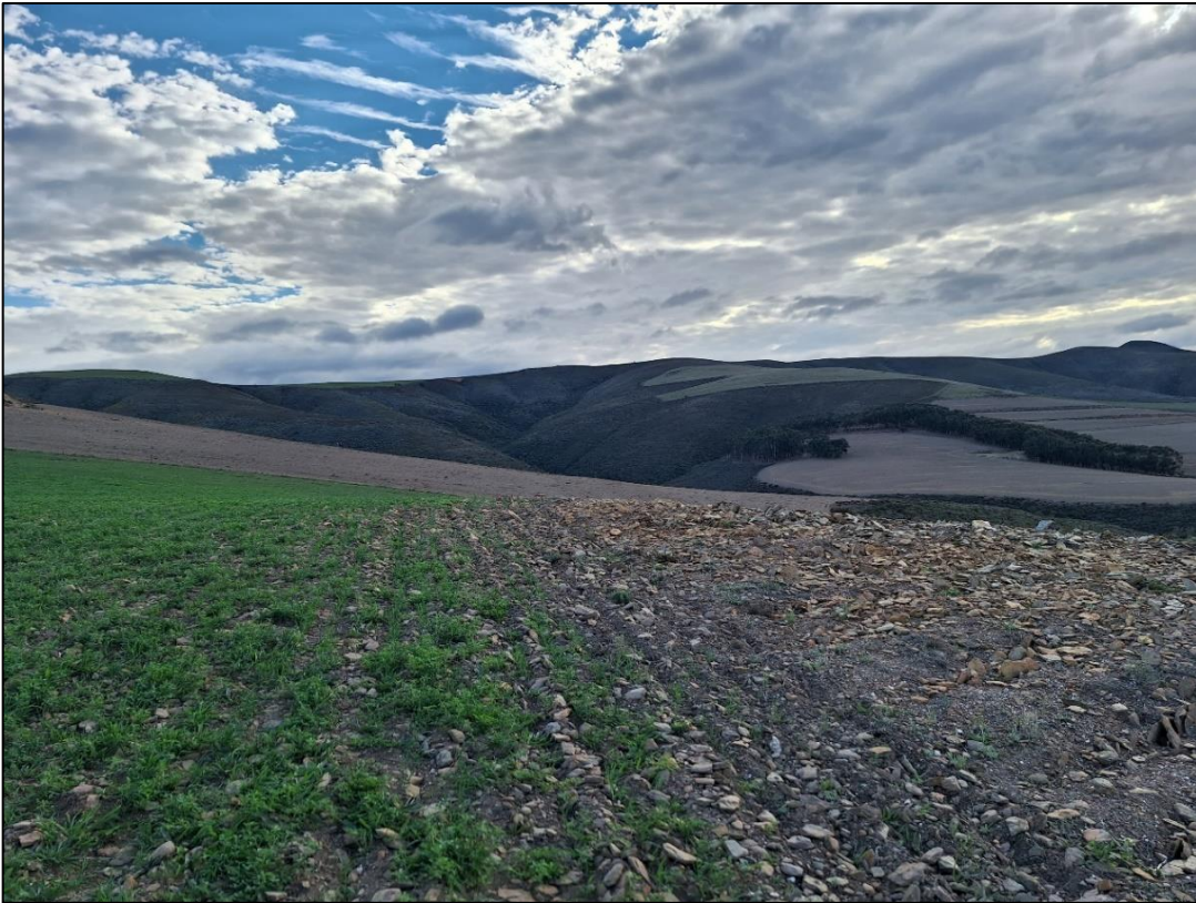
Photo 1: View of the edge between existing farmed area and area cleared.