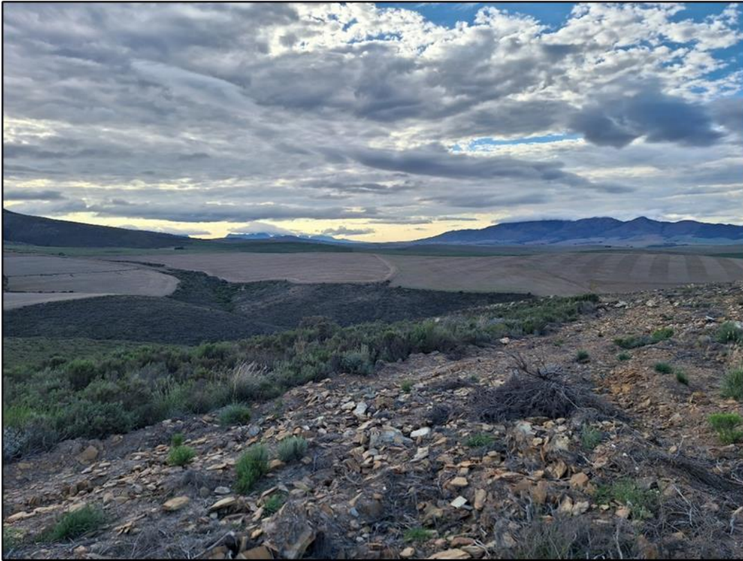
Photo 3. Photo of cleared area alongside remaining intact vegetation (May 2023).