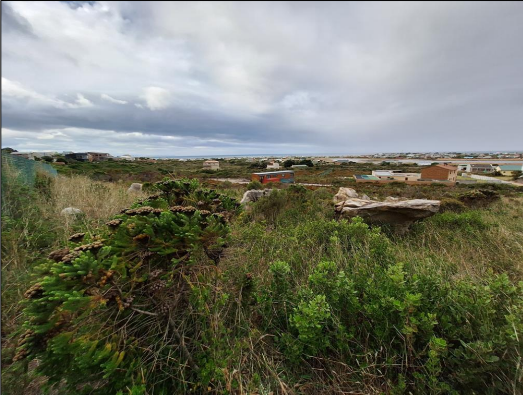
Photo 6: Overview of the intact natural vegetation on the property outside the fenced area.