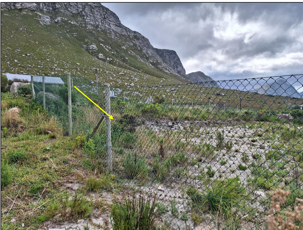
Photo 5: View of the basic fencing installed to protect the area from unauthorized entry.