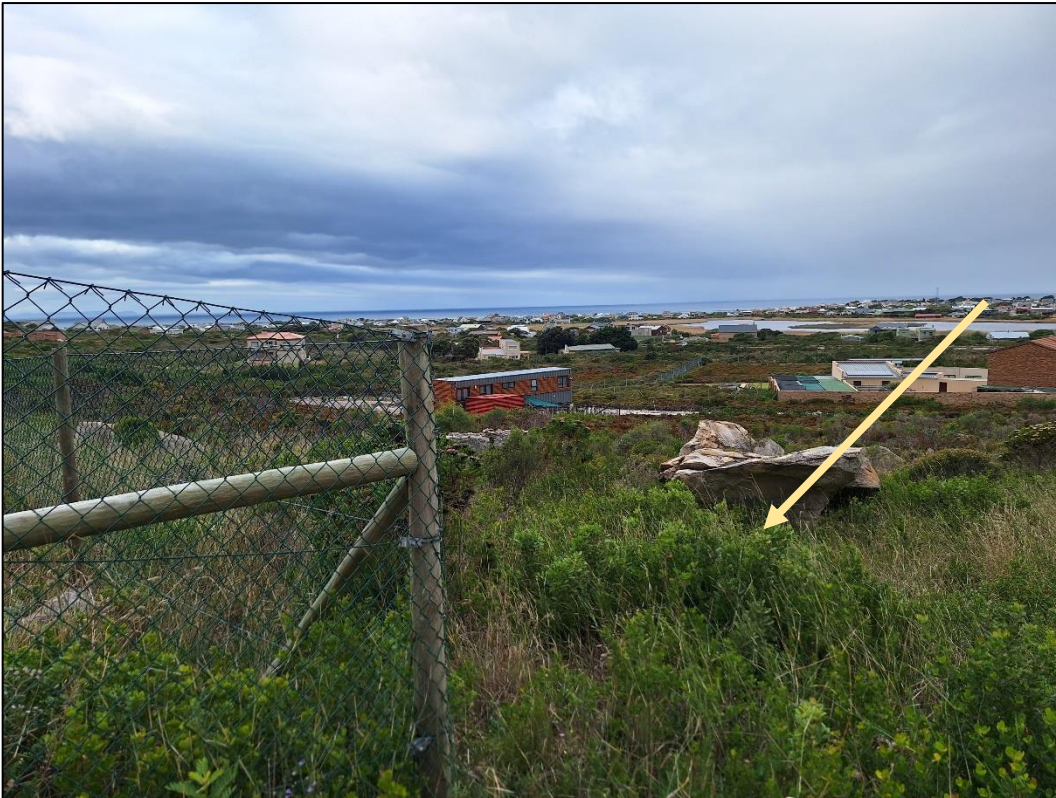
Photo 4: The image shows that some areas on the subject property consists natural vegetation that is still intact.