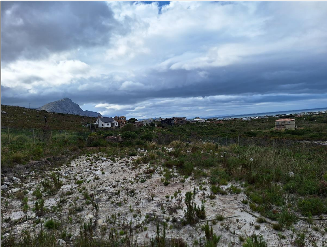
Photo 2: View of the cleared area, alongside remaining the intact vegetation.