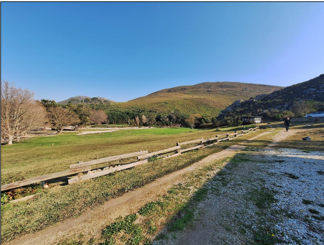
Photo 3: The view of the vegetation condition adjacent to the site.