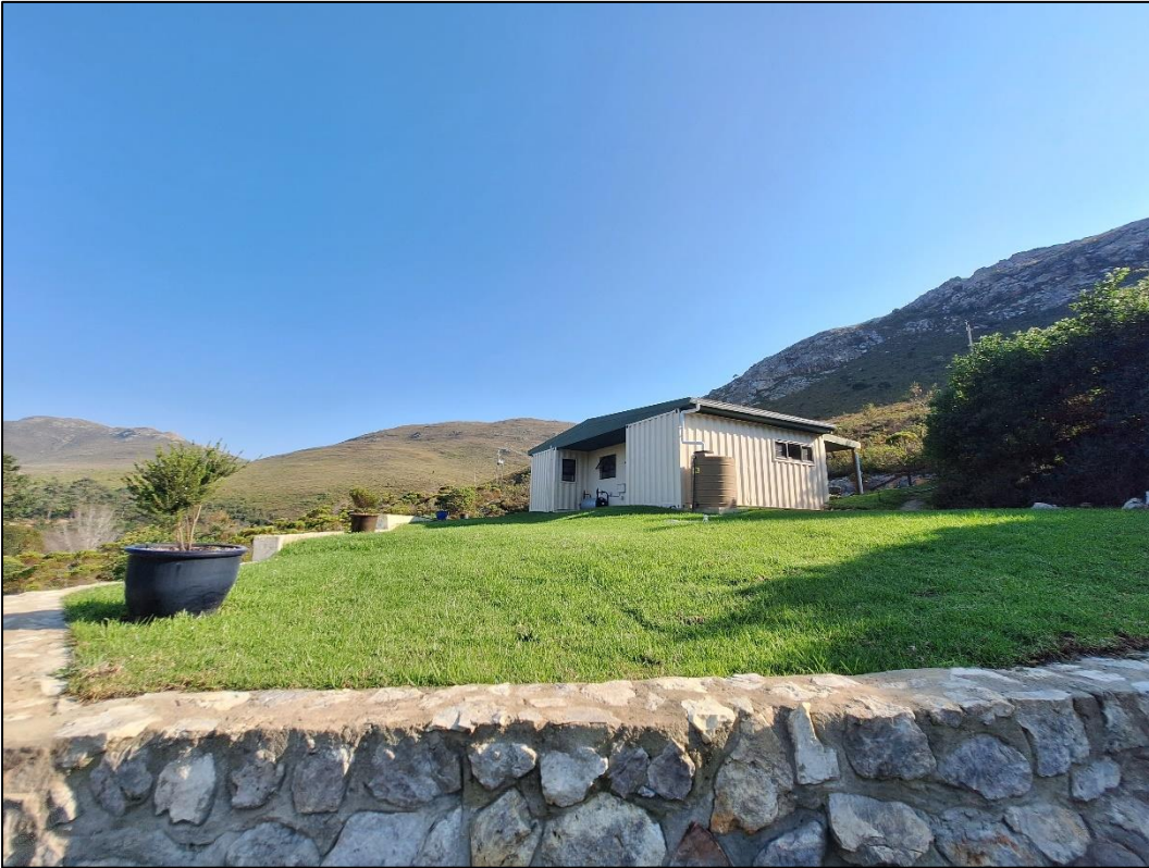
Photo 4: The image shows the back of the single residential housing situated on site.