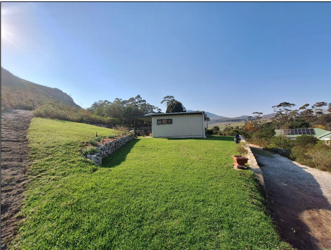
Photo 5: The image shows the side view of the single residential housing on site (2), and terraces made.