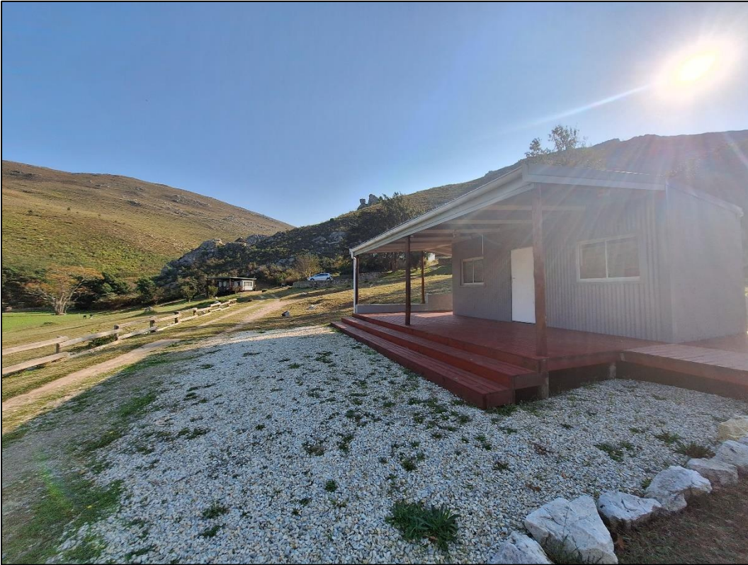
Photo 2: The front view of the office situated on site (1). Notice, there is no concrete cover on the foundation of the structure.