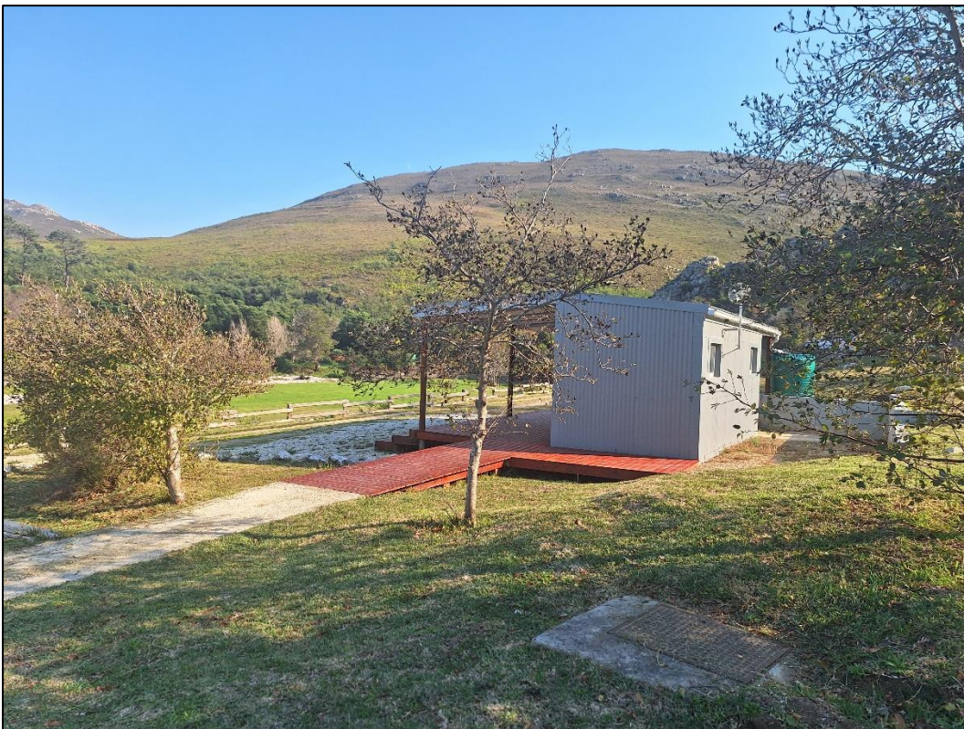
Photo 1: The side view of the office situated onsite (1). The area is lawned grass.