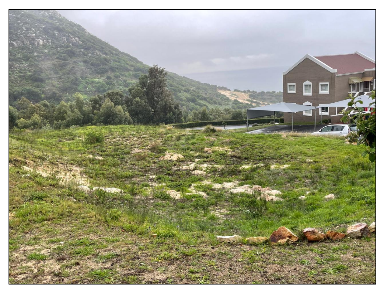
Photo 1 : View looking in the southeast direction. The site earmarked for development is in a degraded state. The area has been significantly impacted and is not in a good quality natural state.