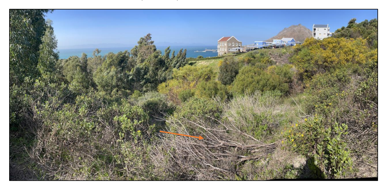
Photo 6 : This image highlights the presence of indigenous vegetation within the northern section of the property. There is visible evidence of initial alien clearing.

Photo 5 : This photograph captures a view of the northern portion of the site, which falls within a Critical Biodiversity Area (CBA). While some areas remain degraded, there is a notable presence of natural vegetation in this section. However, invasive alien species are prevalent.