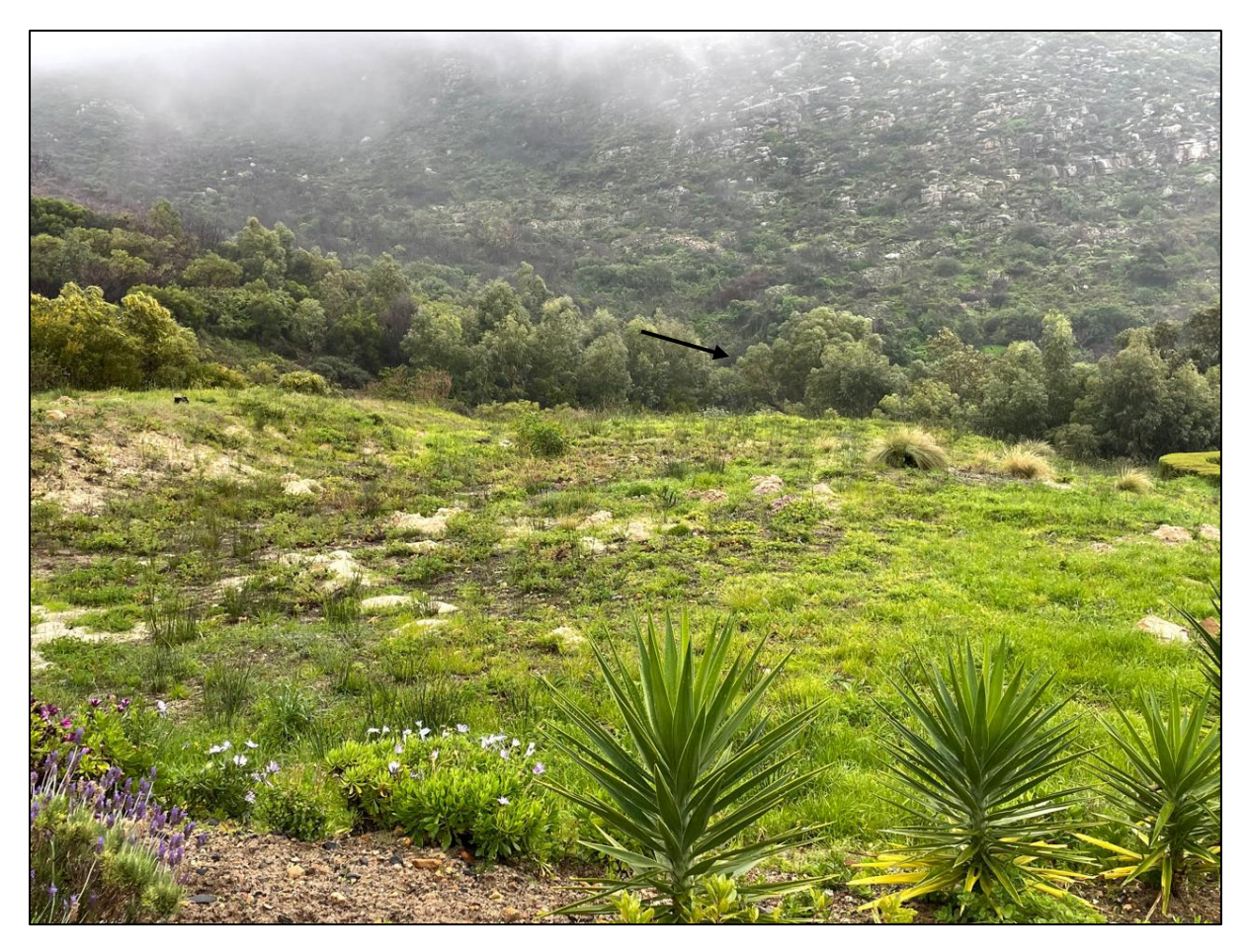
Photo 4: This image highlights the presence of dense alien vegetation. The northern section, although less disturbed, still shows signs of alien invasive species, further emphasizing the need for alien vegetation clearing as part of the rehabilitation efforts.