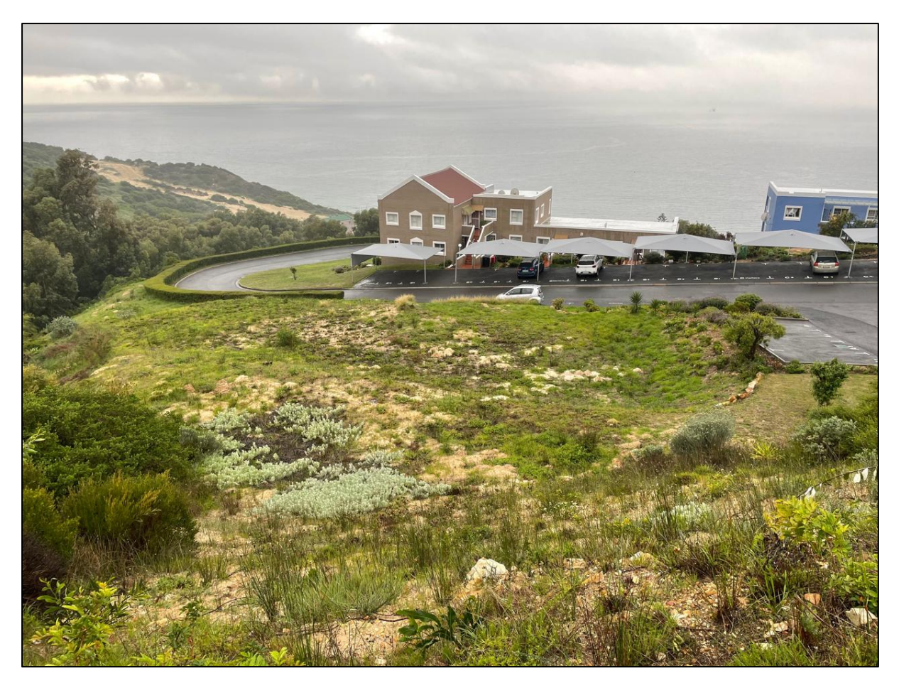
Photo 3 : overall view of the site provides a comprehensive overview of its current condition. The degraded nature is evident, with patches of bare ground and invasive vegetation.