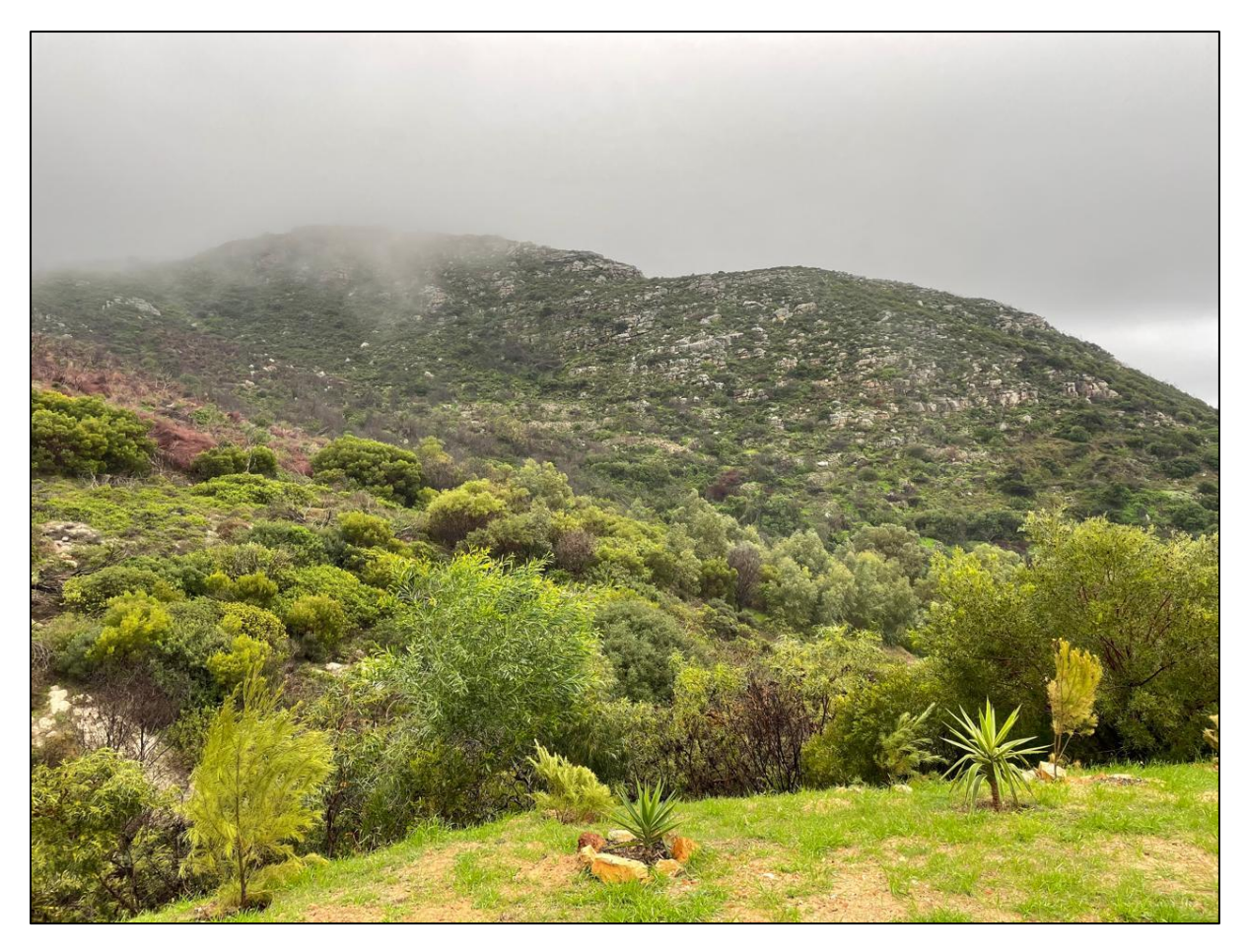
Photo 2 : The site is disturbed, with most of the natural vegetation removed. There is evidence of non-native planted vegetation, indicating landscaping or attempts at revegetation.