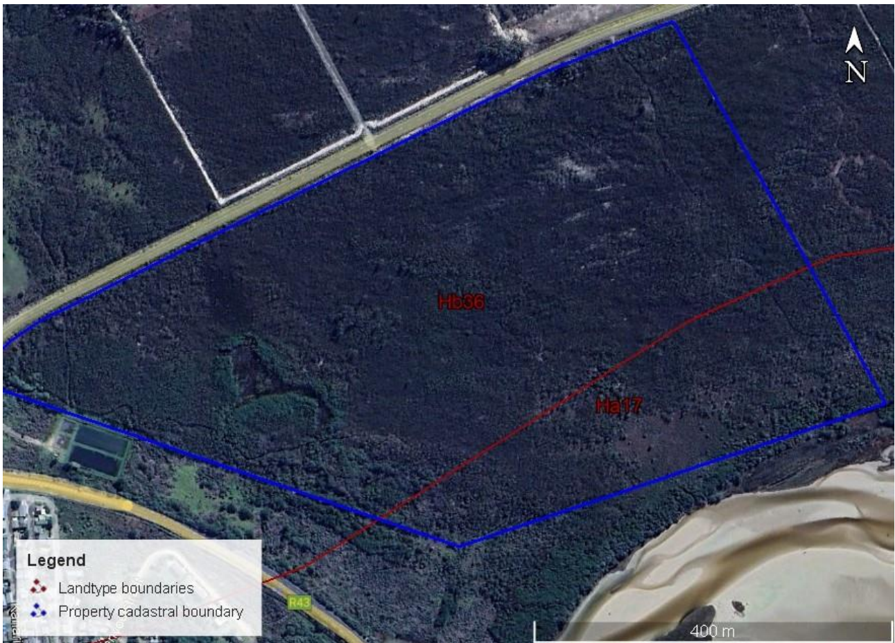
Figure 3. Satellite image map of the site.