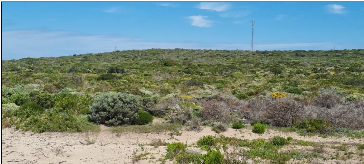
Photo 1: Current conditions on the area proposed for the Solar Array.