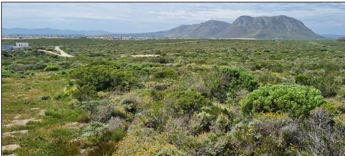
Photo 2: Current conditions on the area proposed for Phase 1 and Phase 2