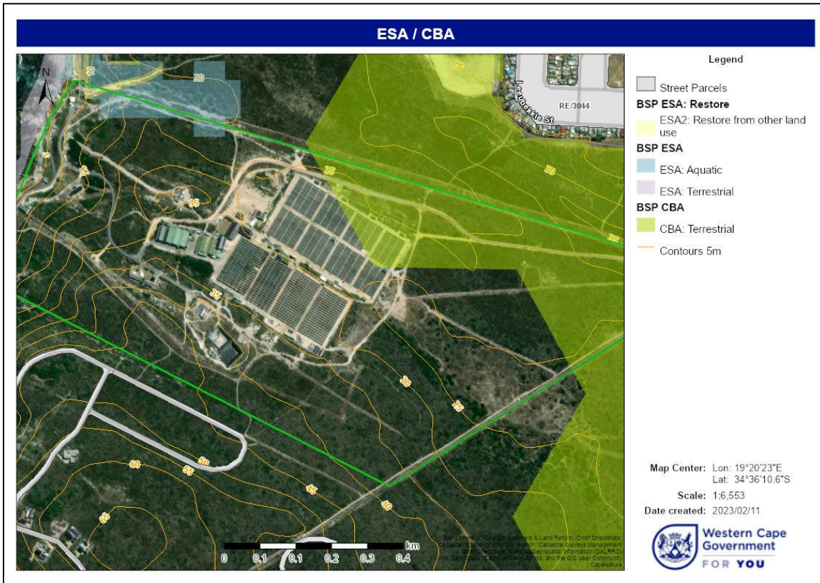
Figure 4: The northeastern part of the property falls on the edge of the CBA.