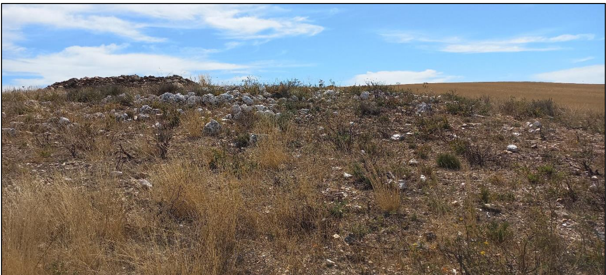
Typical area that would have been cleared. Long since been disturbed by farming practices over the years.