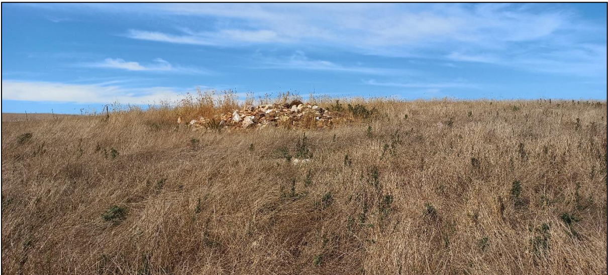
Typical area that would have been cleared. Long since been disturbed by farming practices over the years.