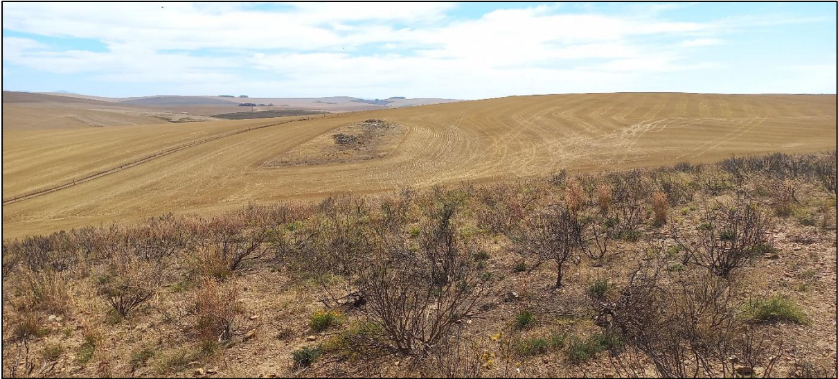
View of the subject property, foreground vegetation indicates the type and state of vegetation typically found in the areas that were cleared. The patch of vegetation in background, is typically what the small patches of cleared areas would have looked like prior to clearance. These patches left between fields have limited biophysical value and are a nuisance to farm operations.