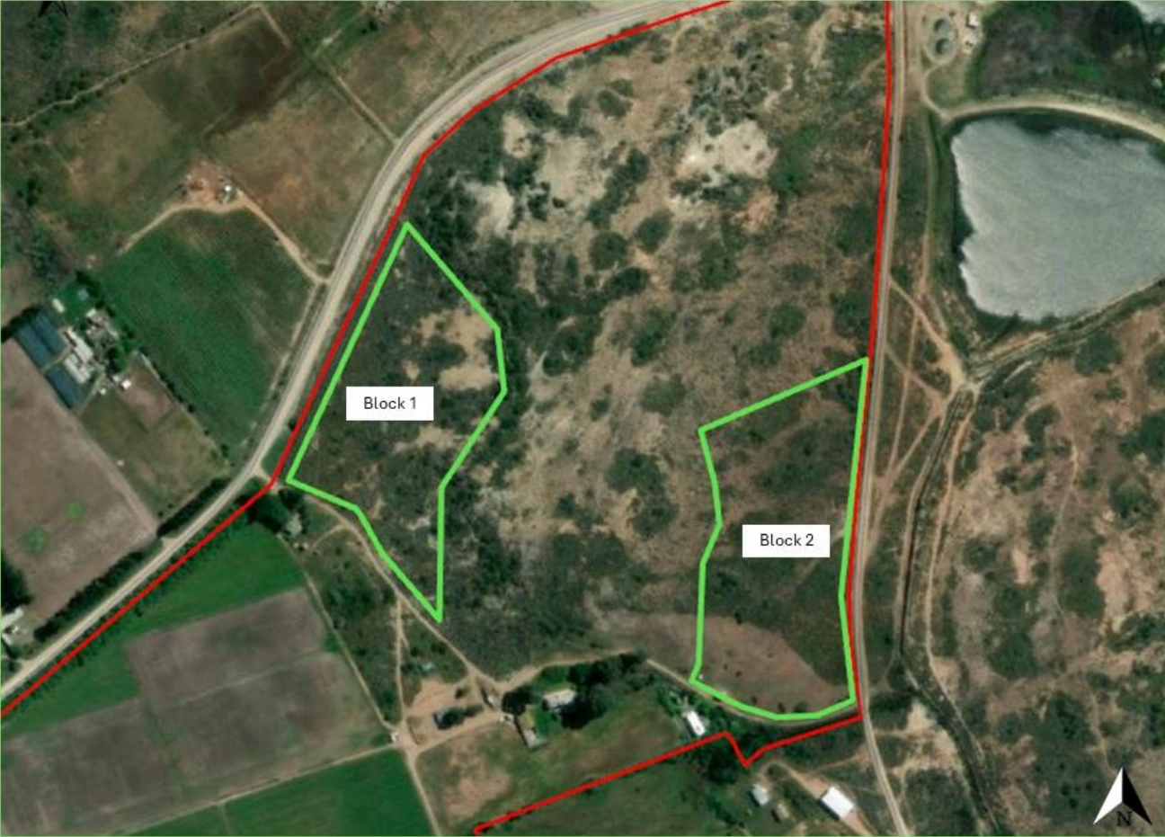
Figure 1: Proposed site layout plan