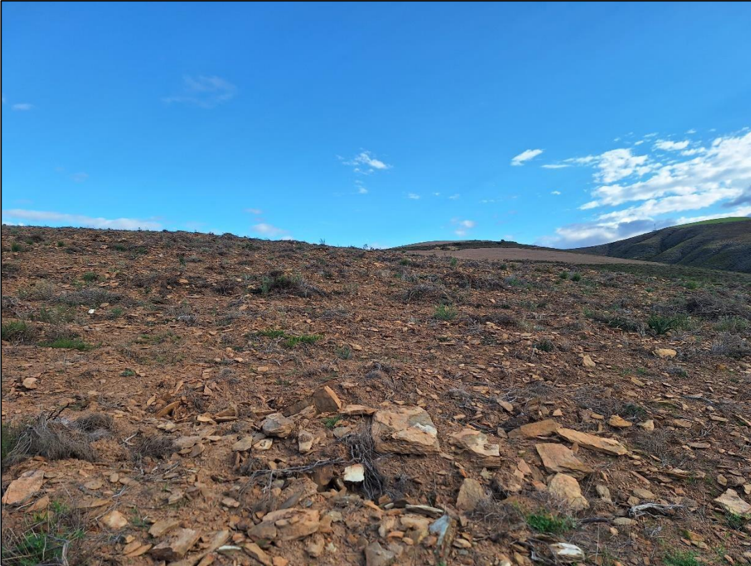
Photo 6. Photo showing roots and remnants of cleared vegetation on the site.