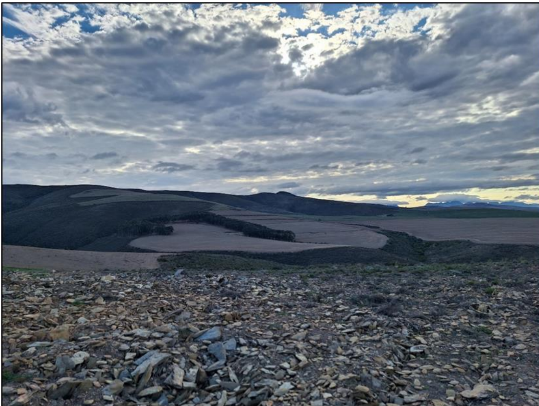
Photo 2. Cleared area on site.