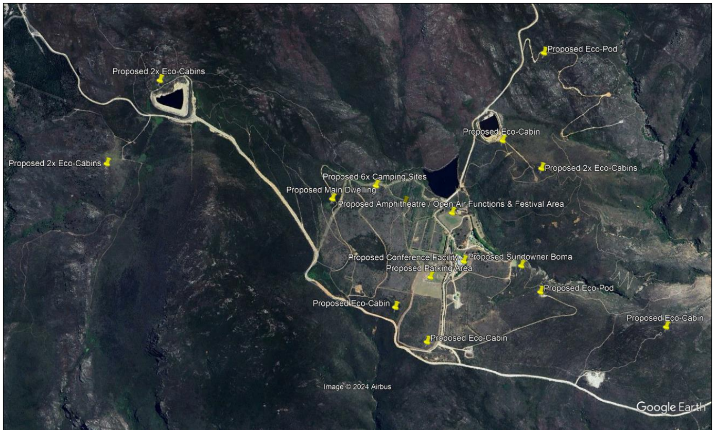
Figure 1. Site Development Plan (Kaplan 2023)