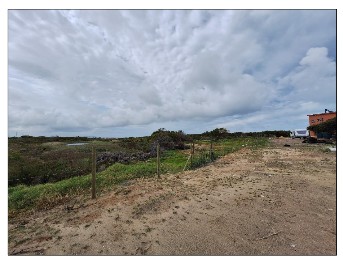
Photo 5. Existing fence maintained on the eastern boundary of the site (September, 2024).