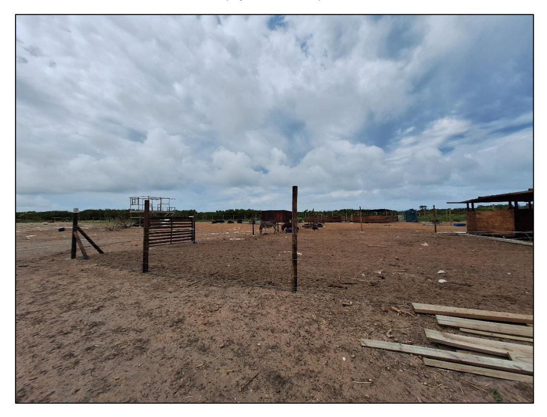
Photo 3: View of the established animal camp following the clearance of indigenous vegetation ( September , 2024).