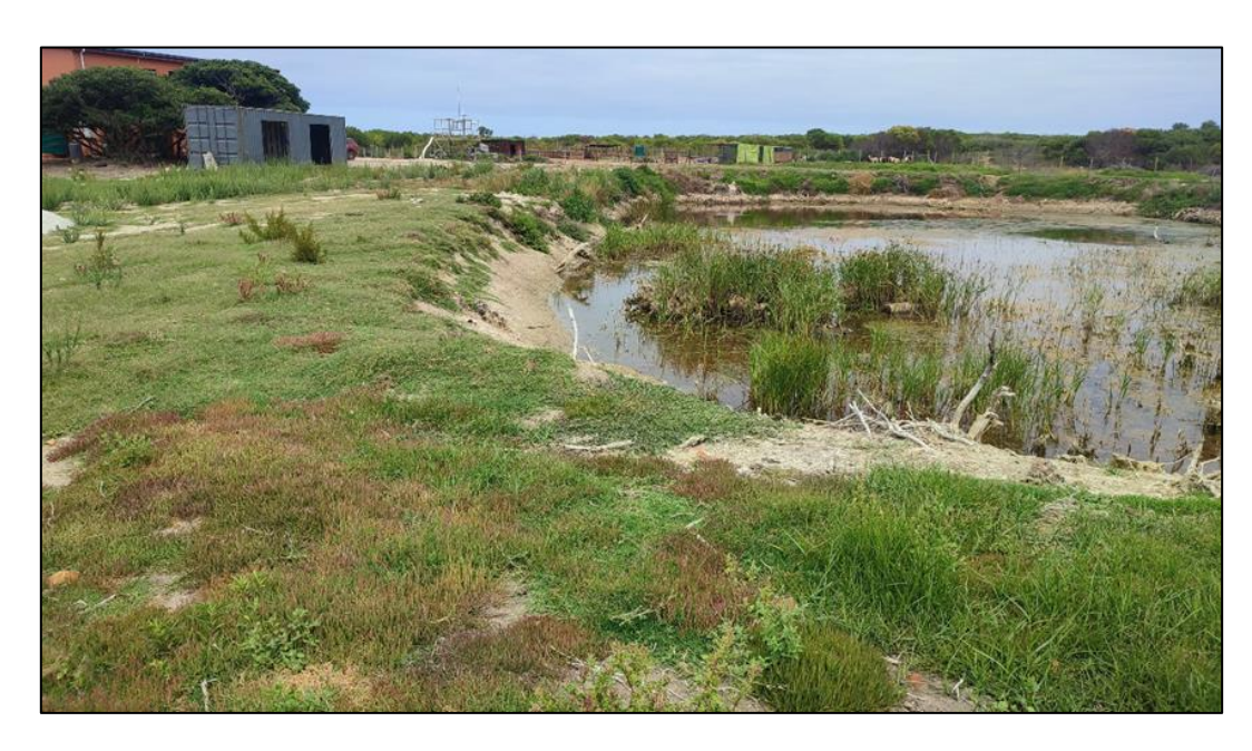
Photo 7 . View of infilled and levelled area, looking southwest. Bolboschoenus maritimus (sawgrass) in the pond, and Cynodon dactylon (kweekgras) dominant around the side.