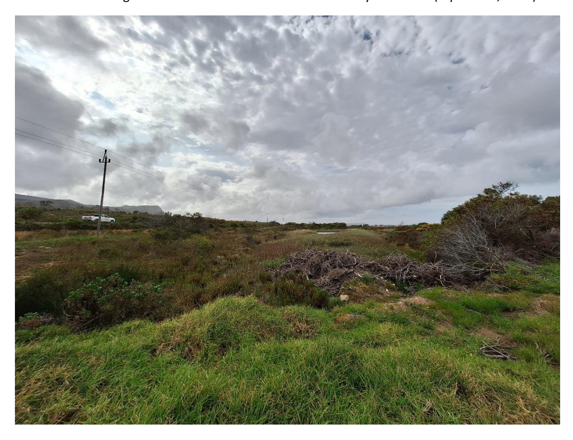
Photo 6. View of the condition of vegetation on the eastern boundary of the site (September, 2024).