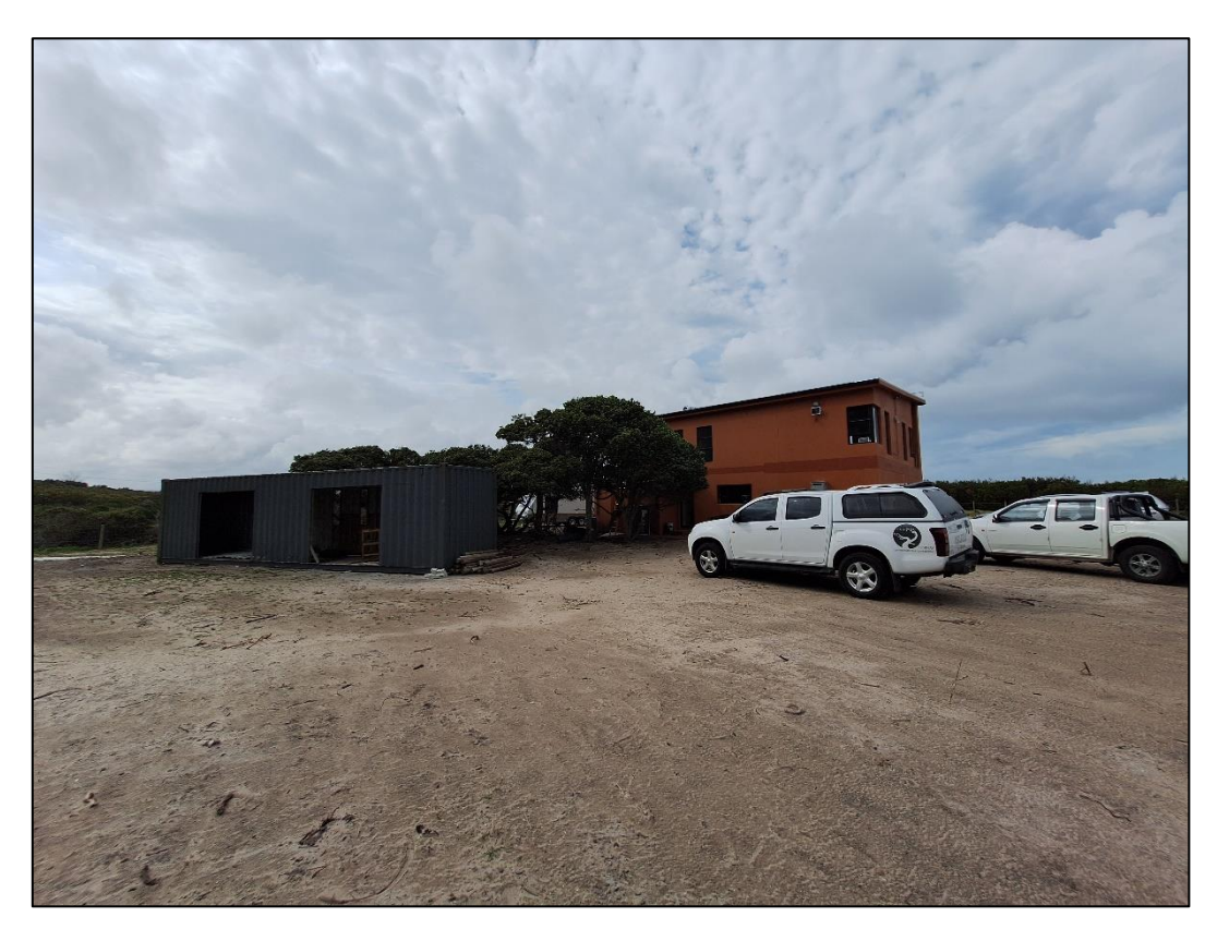
Photo 1: View of the existing structures on the property following the clearance of indigenous vegetation ( September, 2024 ).