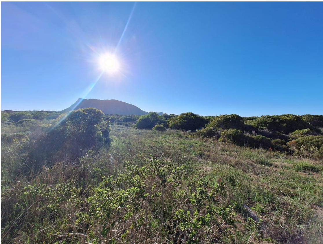
Photo 4: View of indigenous vegetation and the disturbed area (firebreaks).