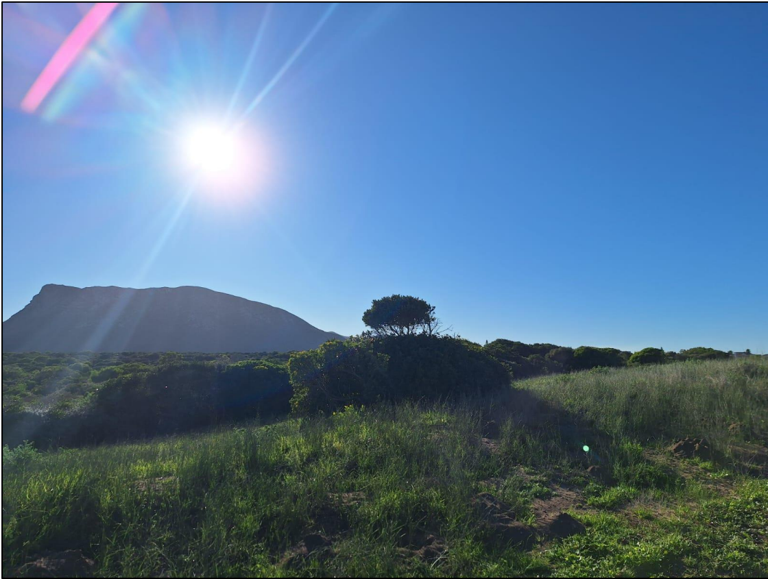
Photo 9: View of the disturbed area (firebreaks) as well as indigenous vegetation.