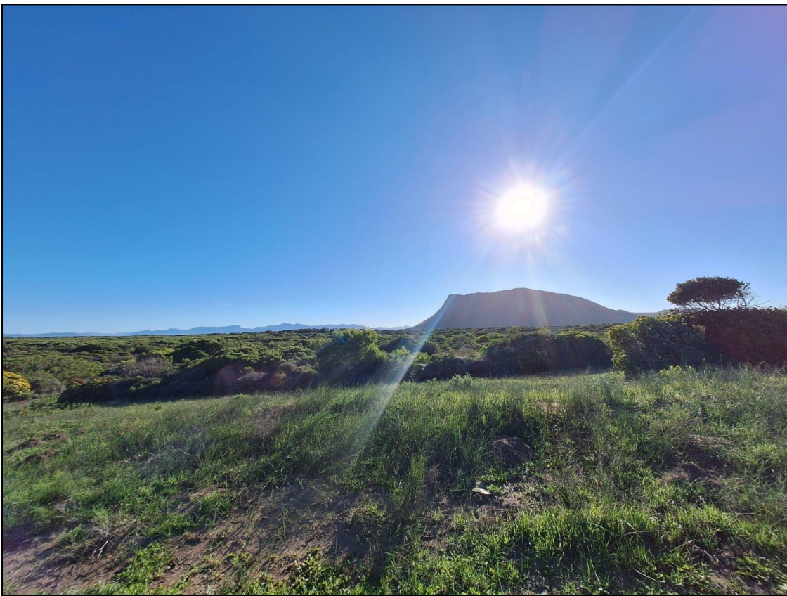
Photo 6: View of disturbed areas on the property and sections of intact vegetation.