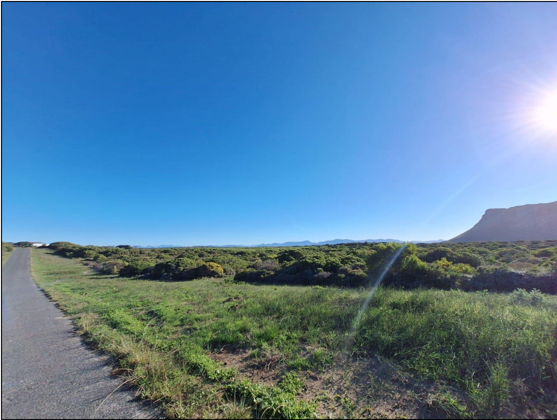
Photo 5: View of the southern boundary of the subject property situated on a right side of the road.