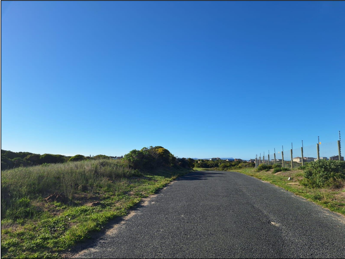
Photo 10: View of the access road that will connect the proposed internal access roads on the property.