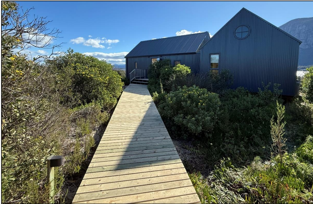
Figure 18. Image showing a slightly raised boardwalk which is providing access to boathouse 4. (Image taken in July 2025).