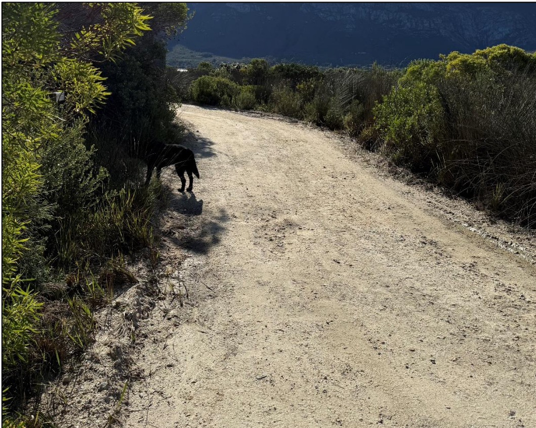
Photo 21. Image showing a 3.8 m 2 width dirt roads providing access to the 5 boathouses.