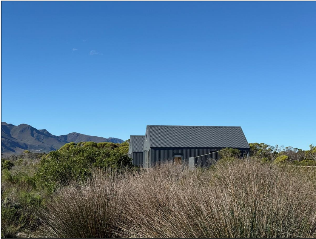
Photo 16. Image showing side view of boathouse 4. (Image taken in July 2025).