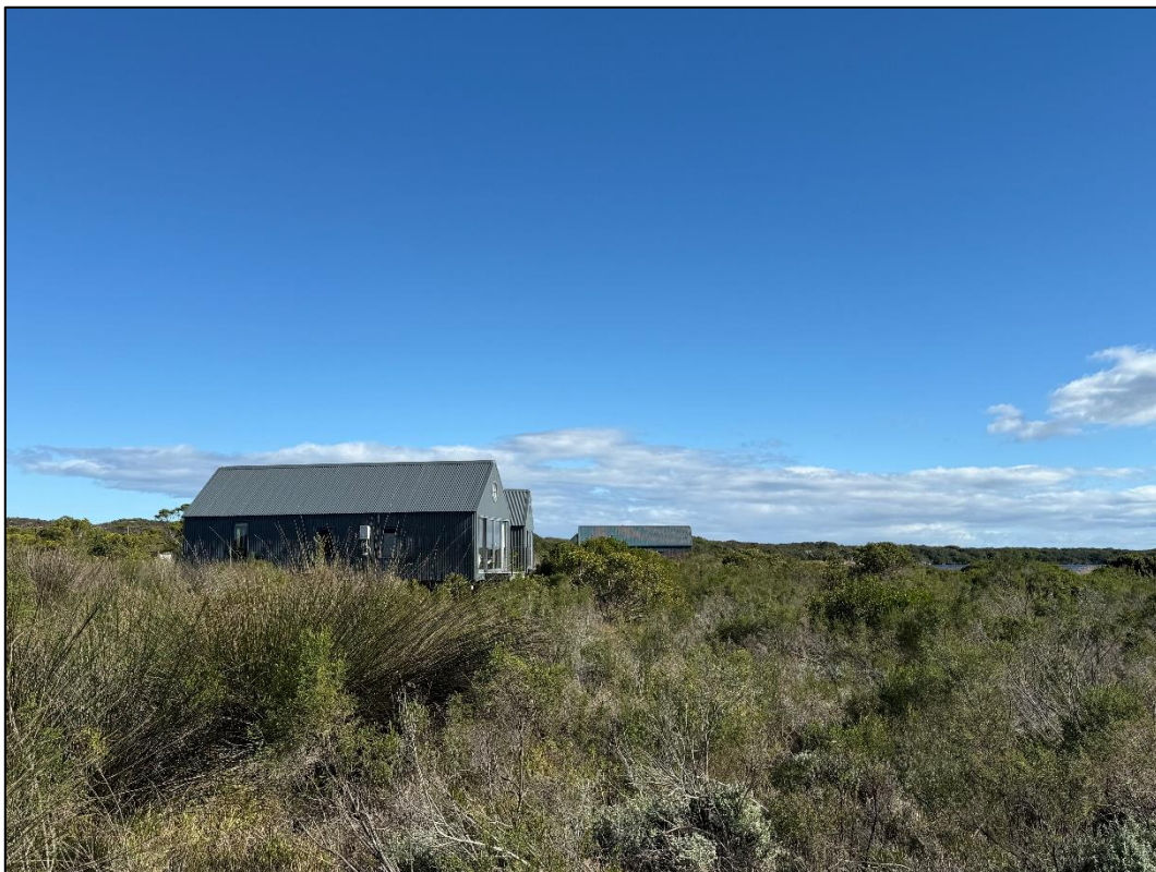
Photo 11. View of boathouse 3 as well as indigenous vegetation present adjacent to the boathouse. ( Image taken in July 2025 ).