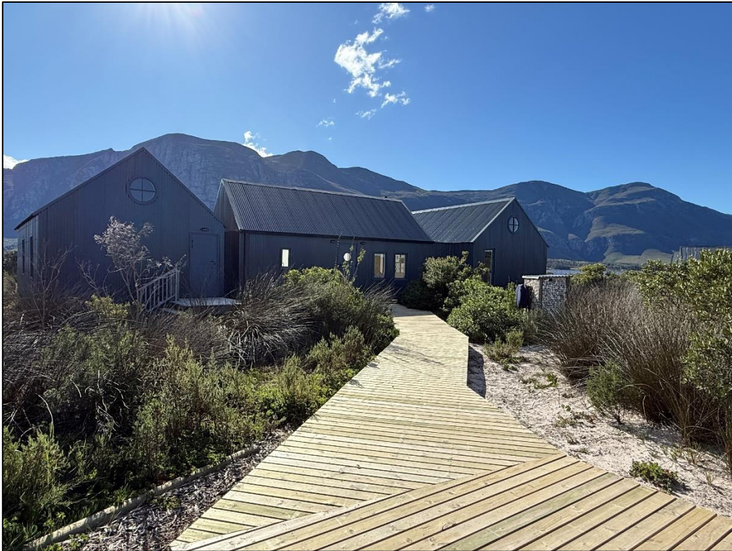
Photo 7. View of the boathouse 2 and a slightly raised boardwalk. (Image taken in July 2025).