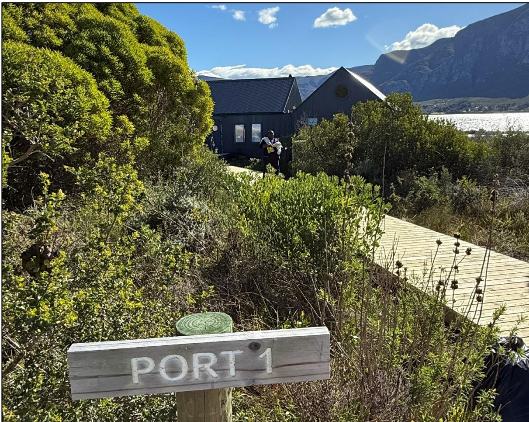
Photo 5. Image showing intact indigenous vegetation next to boathouse 1. ( Image taken in July 2025 ).