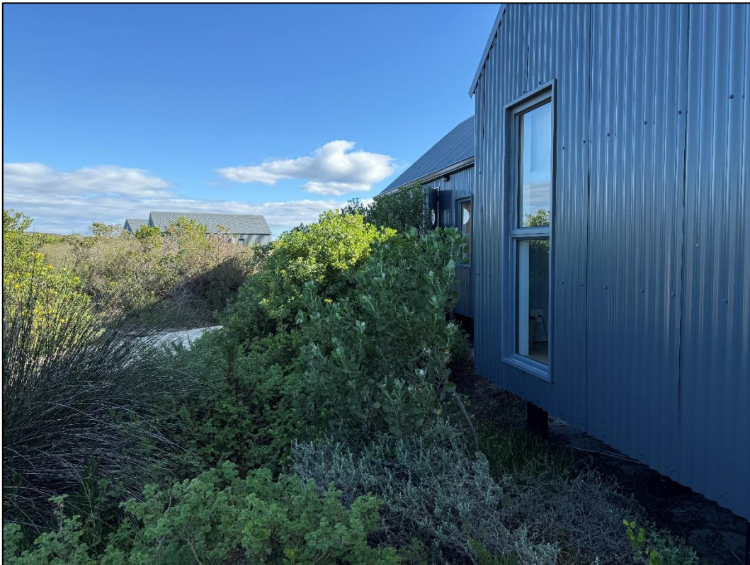
Photo 17. View of indigenous vegetation screening boathouse 4. (Image taken in July 2025).