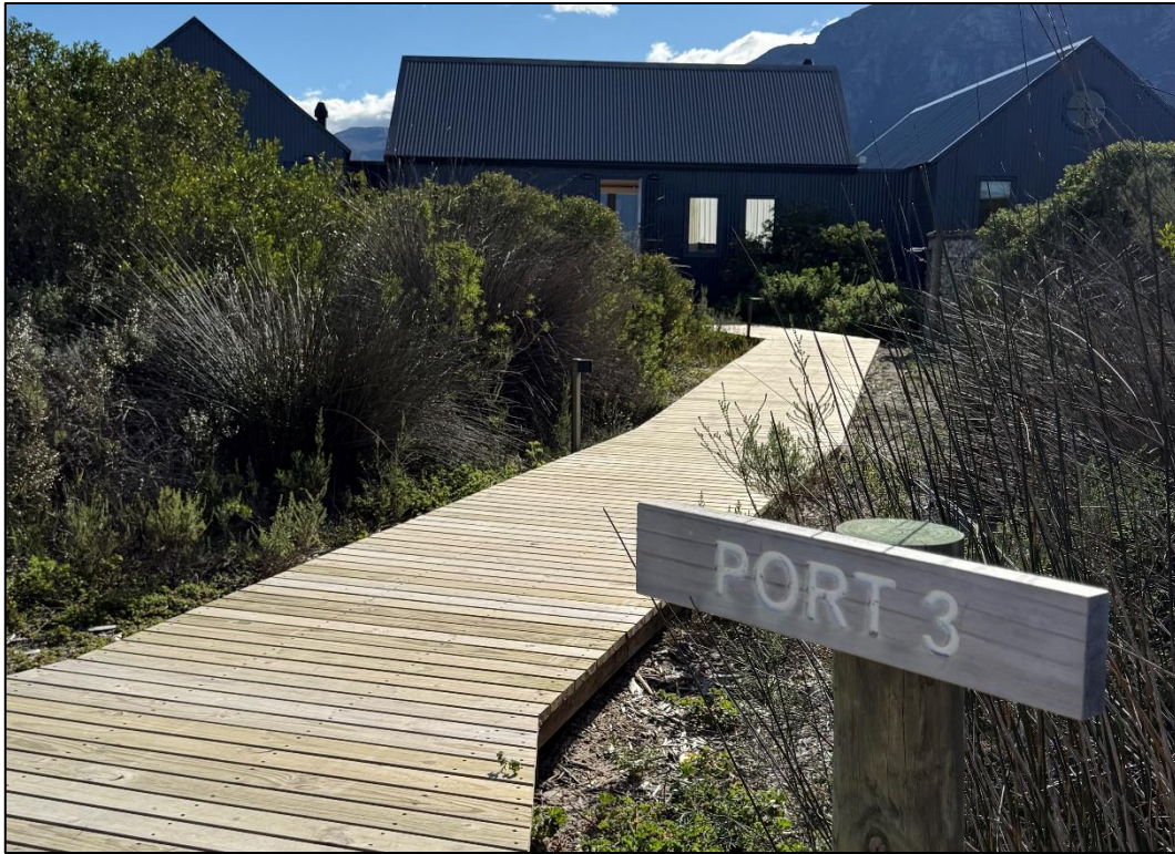
Photo 14. Image showing a slightly raised boardwalk providing access to boathouse 3. (Image taken in July 2025).