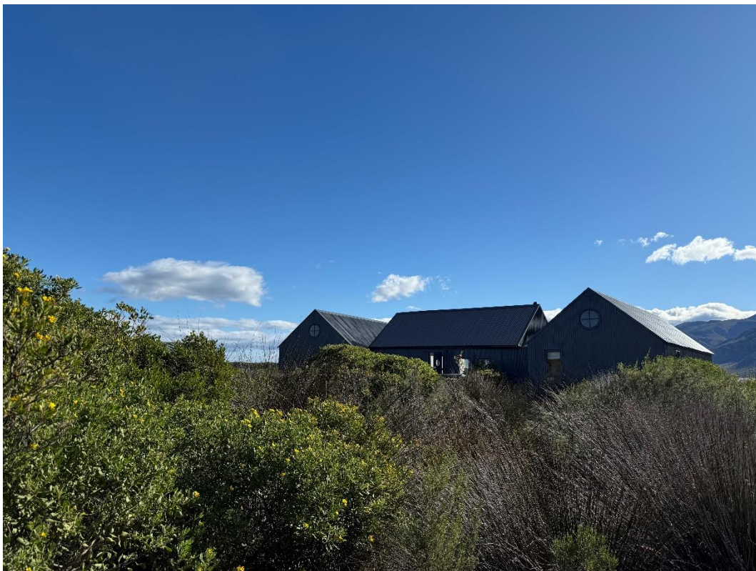
Photo 13. Front view of boathouse 3 surrounded by indigenous vegetation. (Image taken in July 2025).