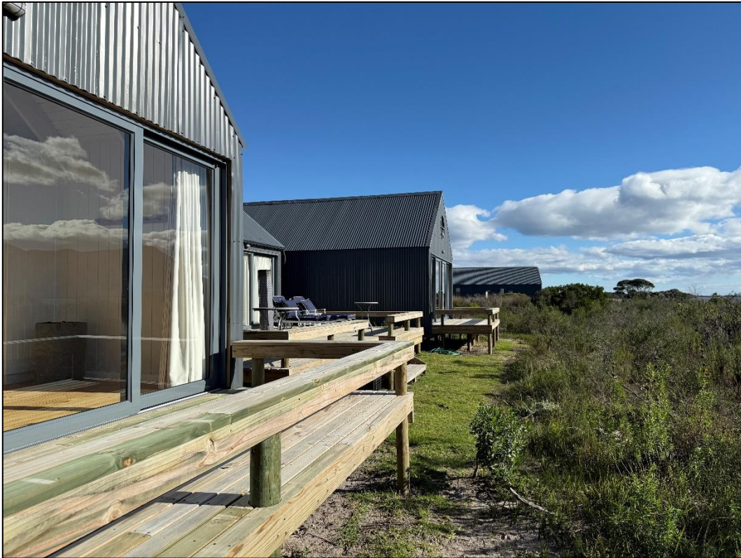
Photo 20. Image showing boathouse 5, lawn area and indigenous vegetation. (Image taken in July 2025).