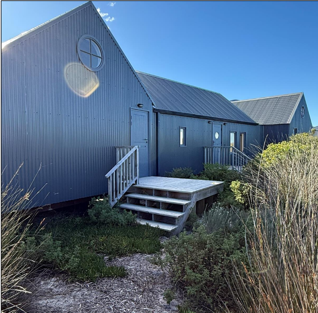
Photo 6. Image showing the front view of boathouse 2 along with the indigenous vegetation slightly screening the development. ( Image taken in July 2025 ).