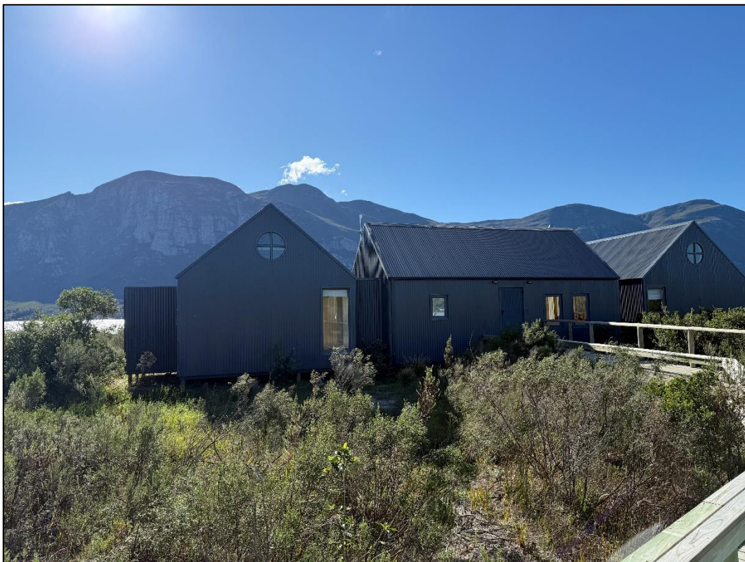
Photo 19. Image showing boathouse 5 which was built in 2024. (Image taken in July 2025).