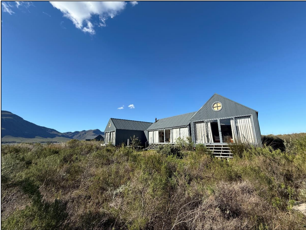
Photo 12. Overview of boathouse 3 along with indigenous vegetation. (Image taken in July 2025).