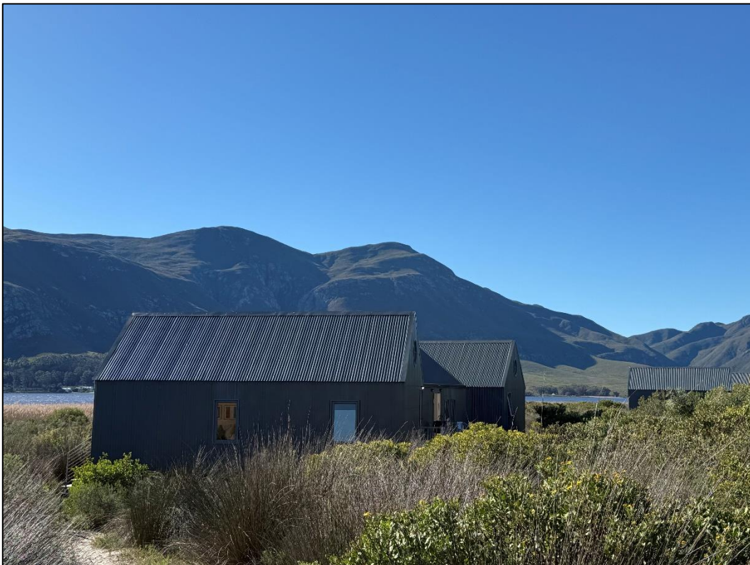
Photo 3. Image showing the indigenous vegetation screenig the boathouse 1. (Image taken in July 2025).