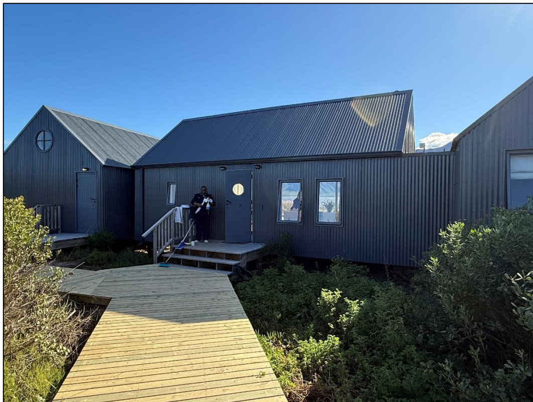
Photo 1. Image showing the front of boathouse 1 and a slightly raised boardwalk. (Image taken in July 2025).