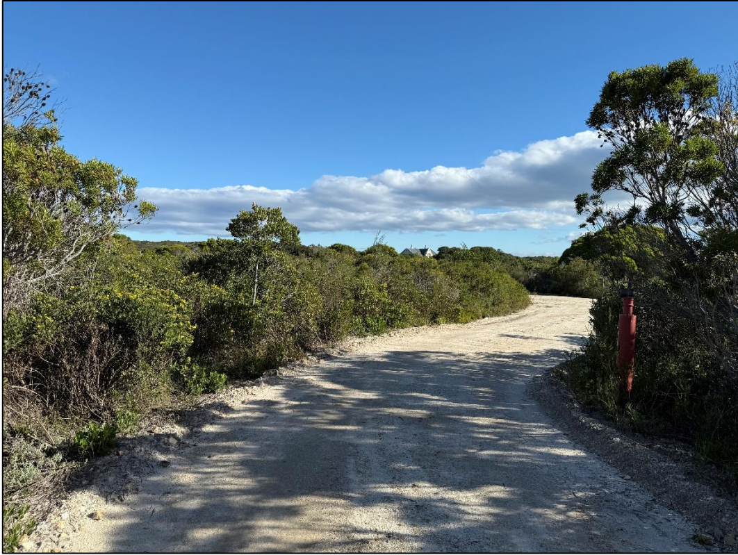
Photo 24. Image showing a dirt road established between indigenous vegetation and a fire hydrant.