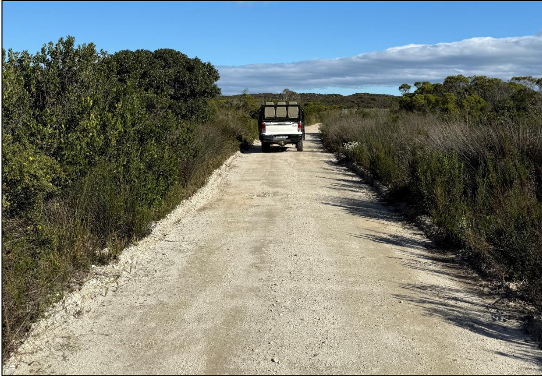
Photo 22. Image showing the dirt road and indigenous vegetation on either side of the road.