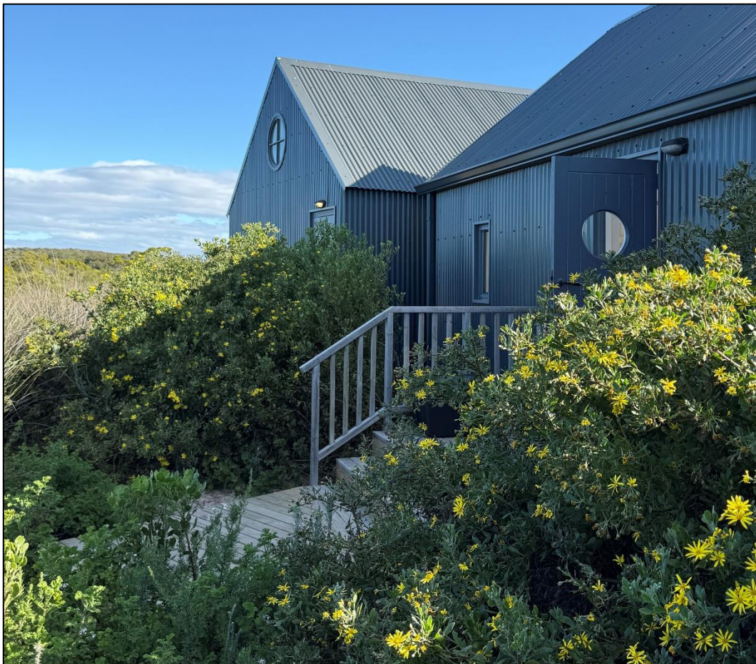
Photo 15. Image showing indigenous vegetation screening boathouse 3. (Image taken in July 2025).