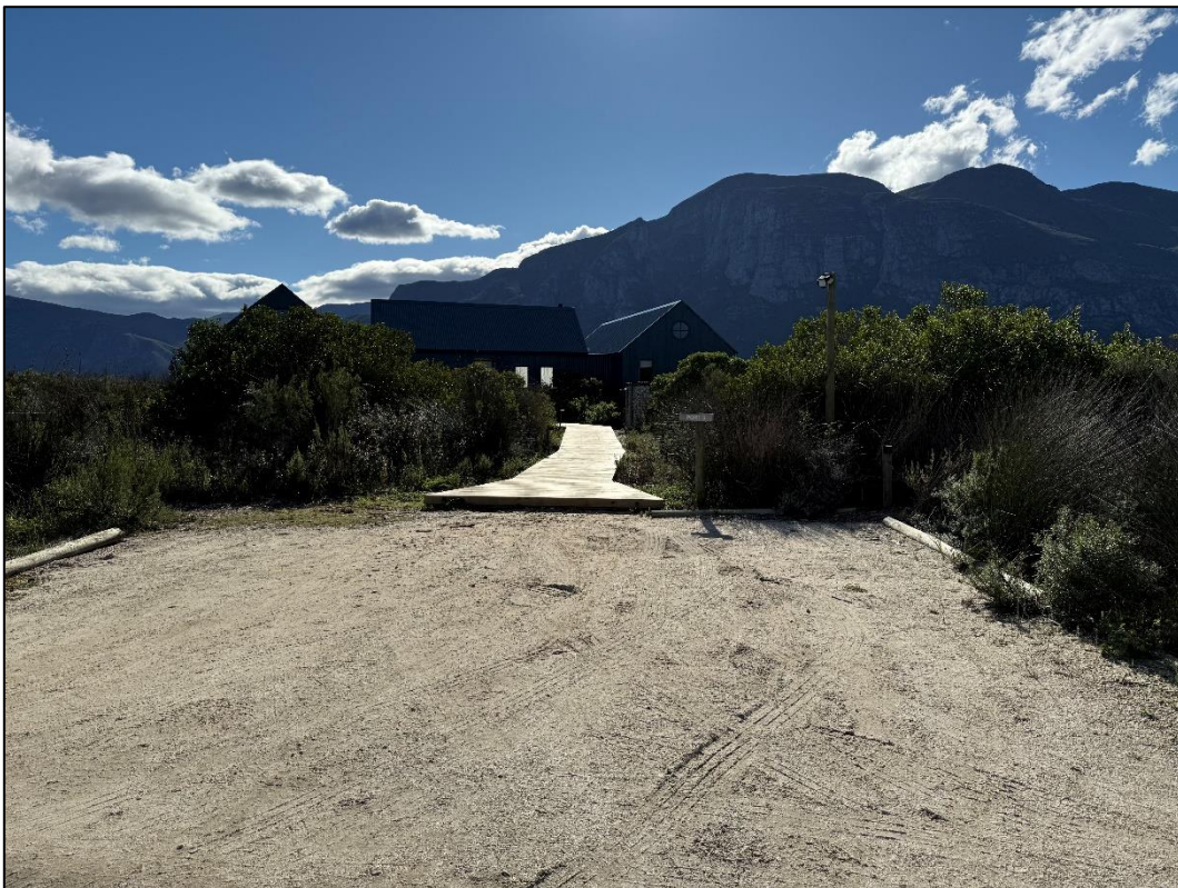
Photo 23. Image showing a parking area for one of the boathouses.