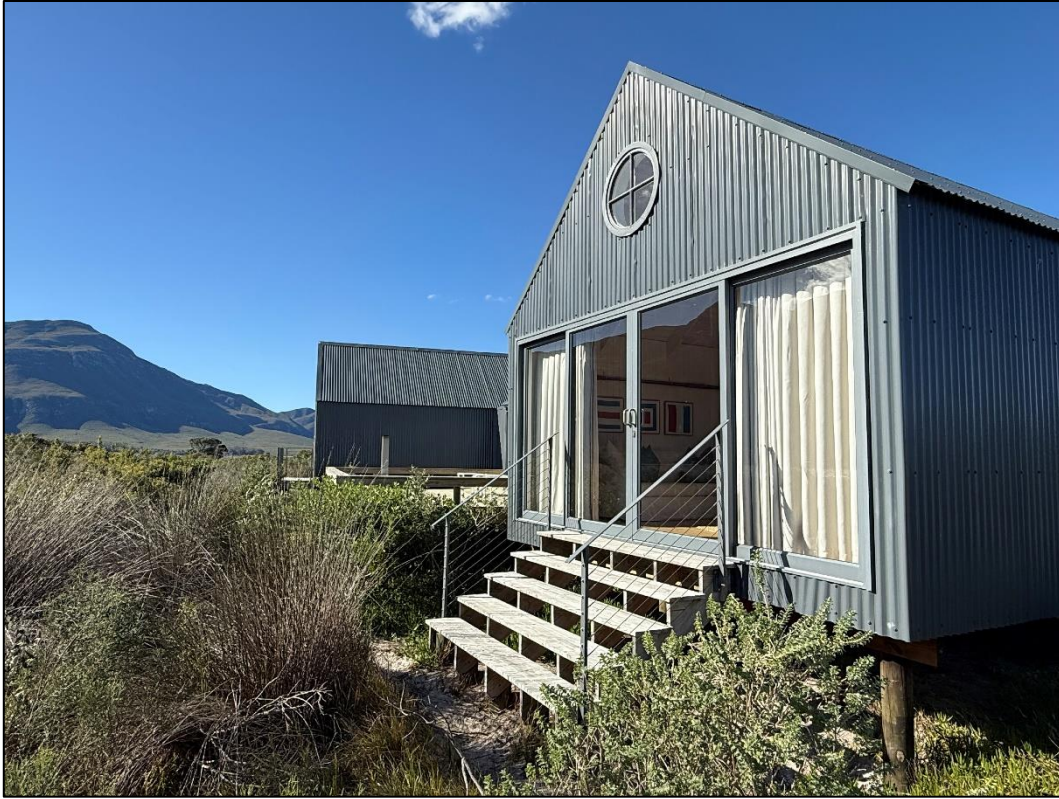
Photo 2. Image showing the side view of boathouse 1 constructed on stilts as well as the indigenous vegetation reestablishing underneath the boathouse. (Image taken in July 2025).