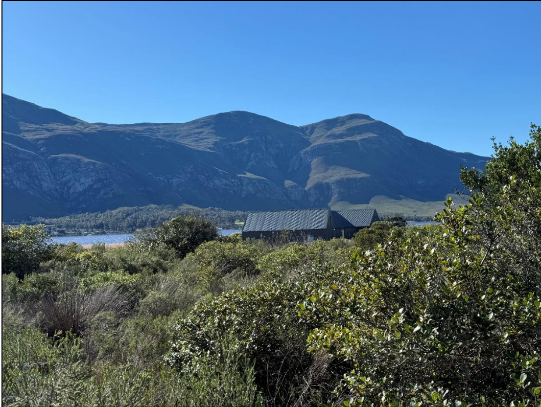
Photo 4. Intact indigenous vegetation around boathouse 1 ( Image taken in July 2025 ).