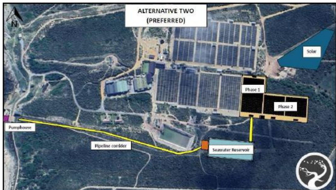
Figure 1: Preferred layout for the Pre-Application Basic Assessment Report. Note the small extent of the solar array relative to the existing structures and relevant landmarks.

To more clearly illustrate the inaccurate spatial delineation of the layouts we wish to refer to the previous preferred layout and current preferred layout below (Figures 1&2). As a reference, the solar array is presented as 4 ha/40 000 m 2 for both alternatives, however is spatially much larger in the current layout. The total footprint for the current preferred layout is much smaller (6.9 ha) than the previous preferred layout (9.6 ha), however this is not evident from the spatial depiction (footprints as stated in the BAR).