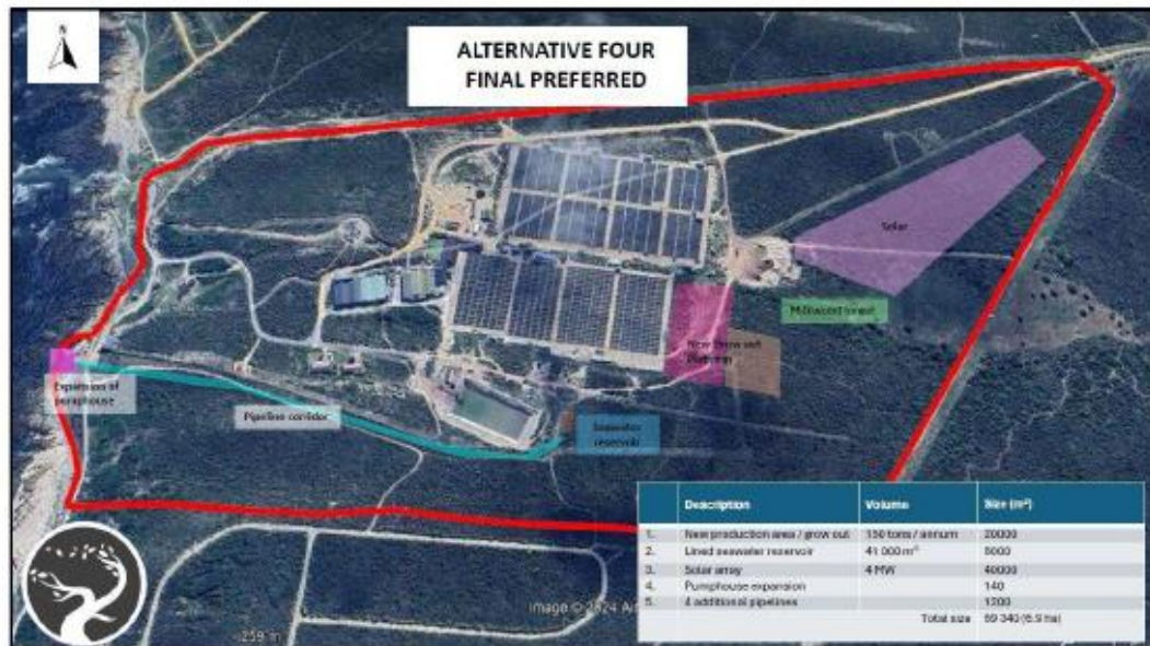
Figure 2: Preferred layout for the Draft Basic Assessment Report. Note the large extent of the solar array relative to the existing structures and relevant landmarks.

Notwithstanding the above, the revised botanical assessment assessed the purported alternatives presented in the Pre-Application BAR, although it is not known which of the two spatial depictions is accurate/more accurate. With regards to the location of the SCCs, Alternative 1 is preferred as Phase 2 of the expansion area for Alternative 2 impacted on the all the SCCs but Phase 2 for Alternative 1 impacted on none. Alternative 1 was not the preferred alternative in the Pre-Application BAR. In the impact assessment, Phase 2 is rated as medium negative for Alternative 2 as it was for the initial layout, however for Alternative 1 it is reduced to low negative. The location of the seawater reservoir remains the same for all alternatives and therefore remains medium-high negative. The residual impact significance therefore remains above the threshold requiring a biodiversity offset, although it is motivated that an alien clearing offset is preferred to securing more of the same vegetation type according to the offset ratios.