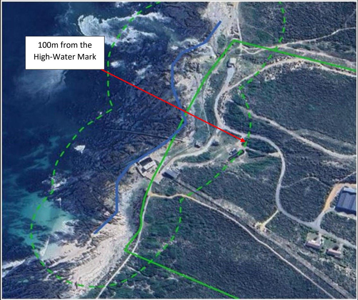
Figure 3: Regulated area within the 100m of the High-Water Mark.