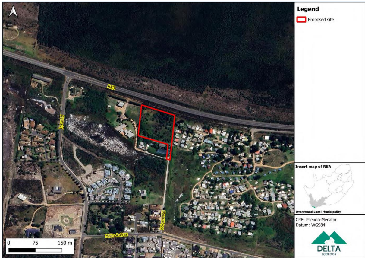
Locality of subject property

The proposed activity involves the rezoning and subdivision of Erf 1489 and 1490 to create a residential development. The properties are located in the built-up residential area of Vermont, just south of the R43.